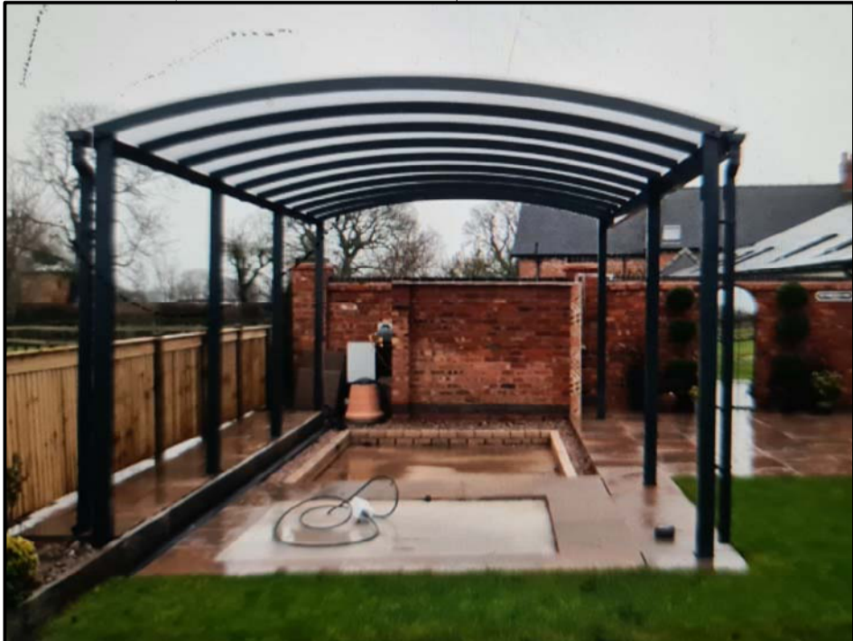
IMAGES OF PROPOSED CAR PORT