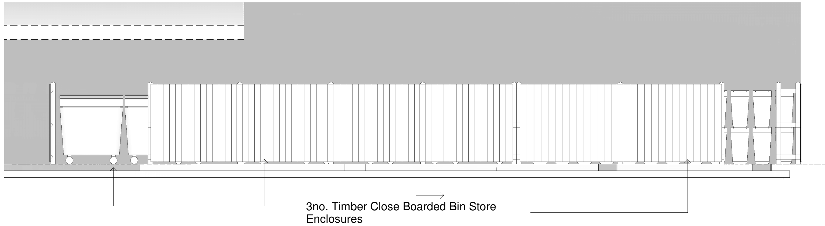
3 Bin Store - Elevation 1 : 50