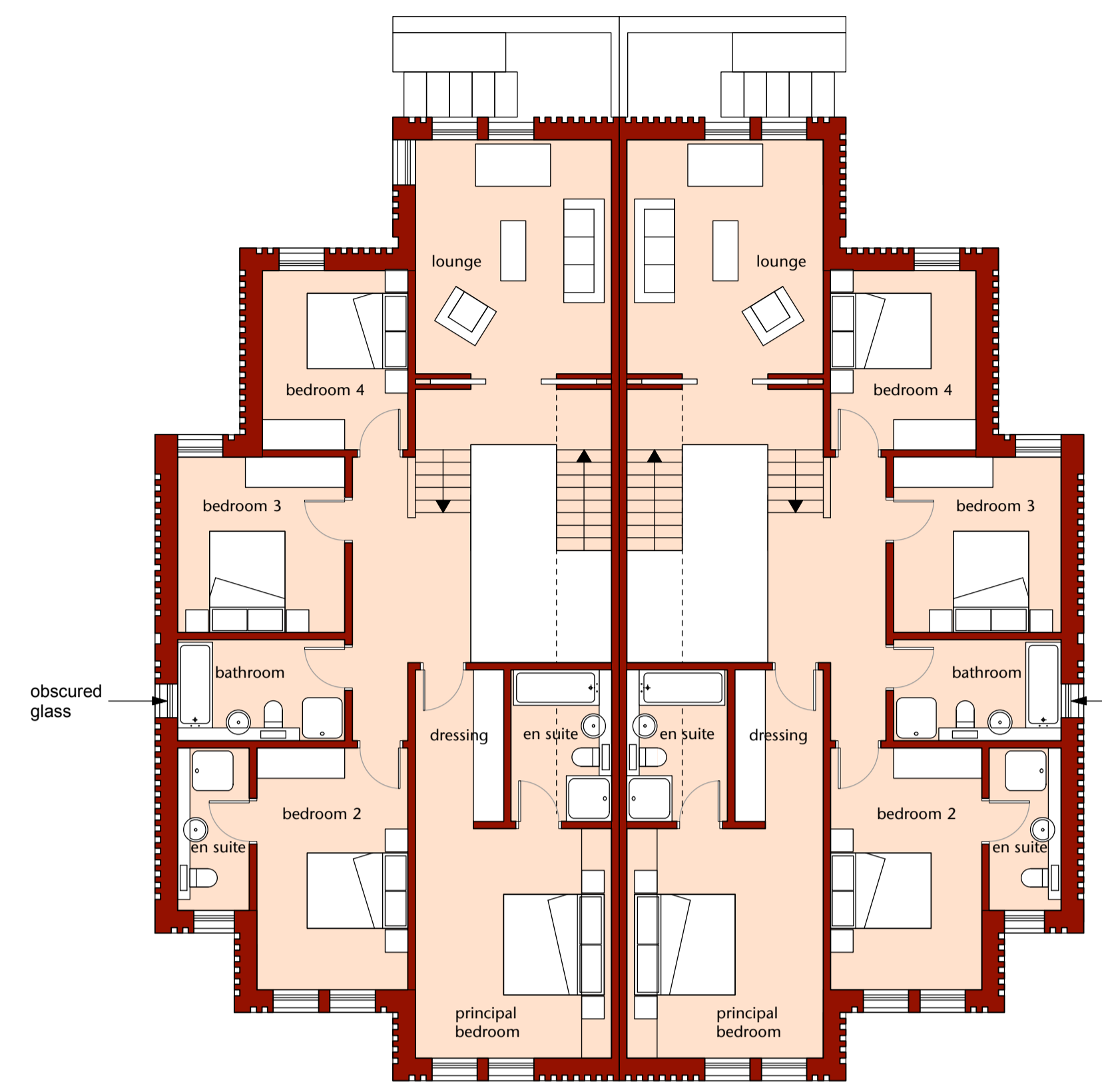
2 Proposed First Floor Plans 1:100