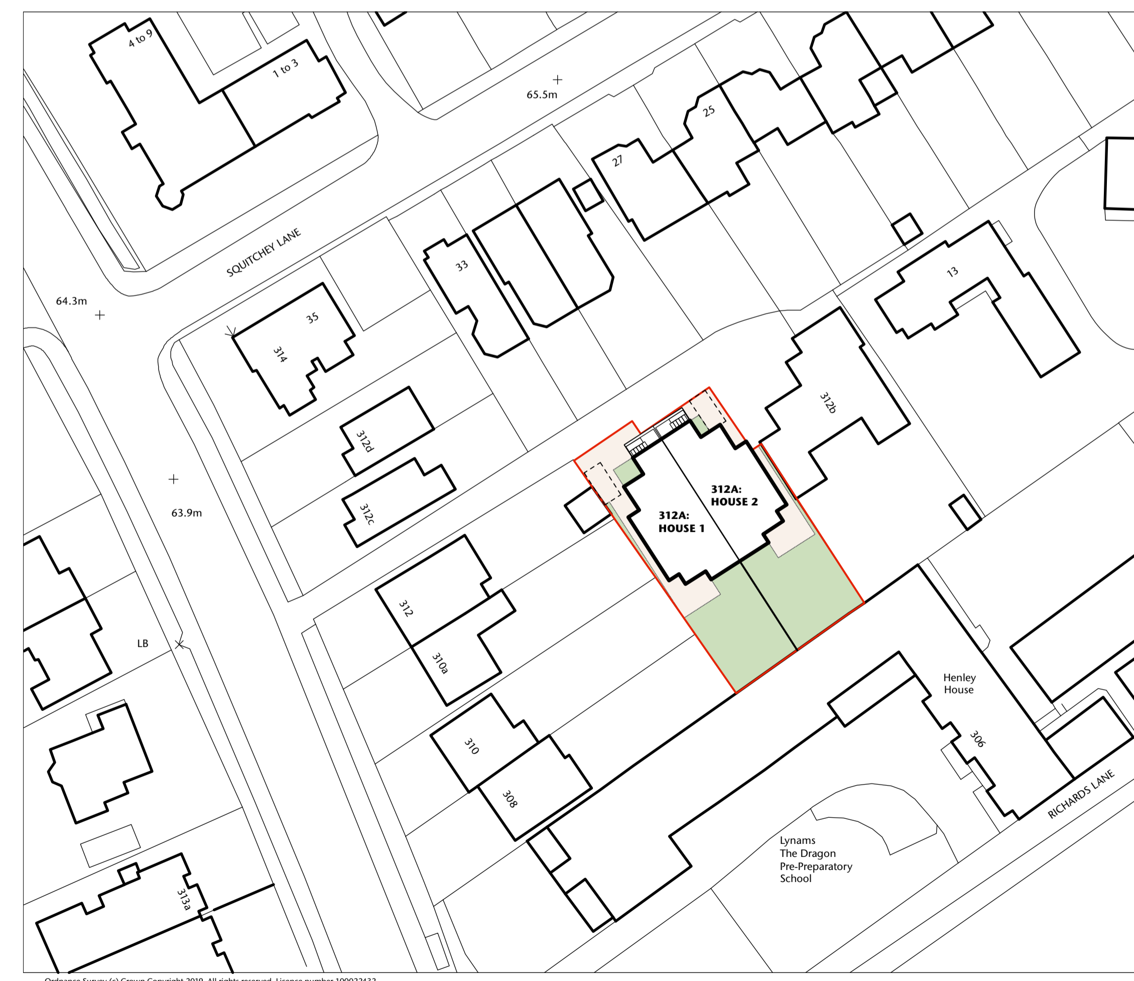
4 Proposed Site Block Plan 1:500