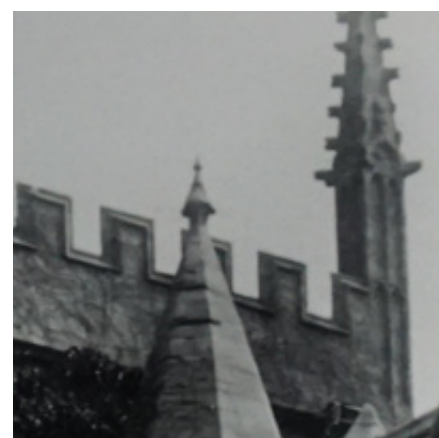
24. Tower Pinnacle