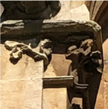
4. Vines and flowers to westerly column head for replicating at east