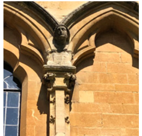
22. Example of engaged column to north elevation