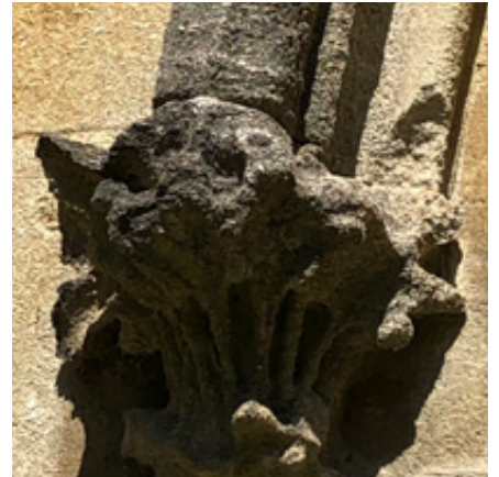
6. Missing leaf to arch base at entrance door