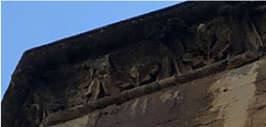
18. Carved entablature to tower