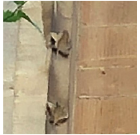
12. Leaf point missing to engaged column on north elevation