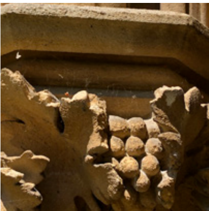
7. Leaf points missing to carved arch base