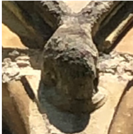
5. Decorative stone head which has lost all definition