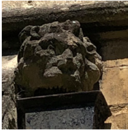
11. Lions head to rainwater hopper