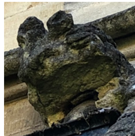
17. Carved stone to north elevation rainwater head which has lost most definition