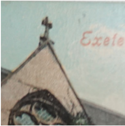
10. Historic image of gable pinnacle