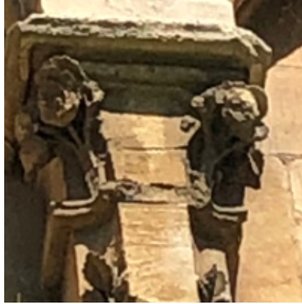
2. Missing string course to column head