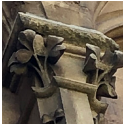
14. Missing leaf to column head