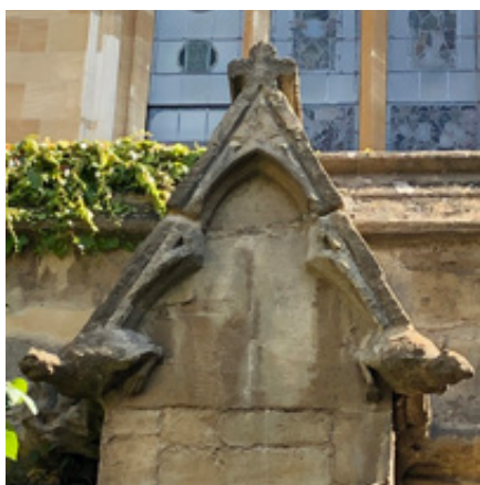
23. Annexe buttress