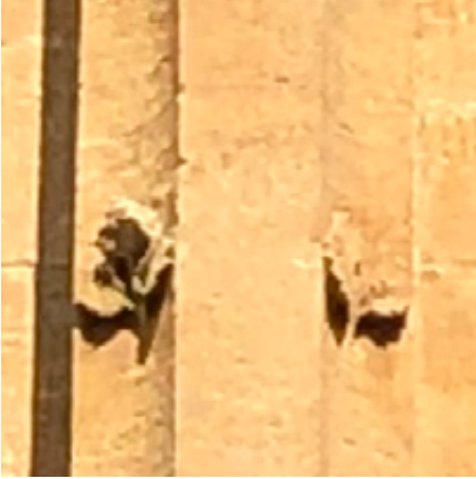
1. Leaves to engaged columns