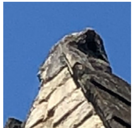
9. Missing pinnacle to gable