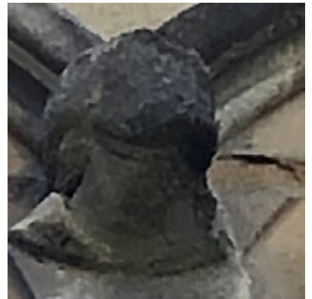
15. Decorative stone head to north elevation which has lost most definition