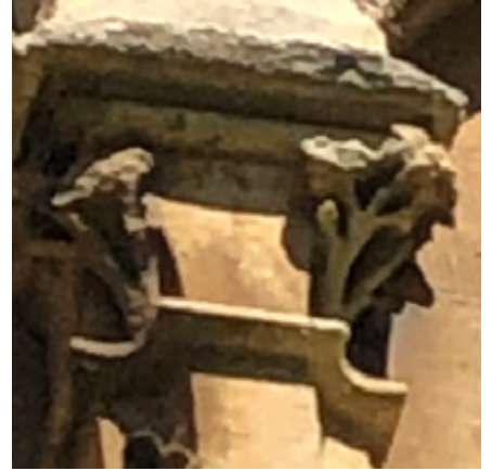
3. Missing leaves to entablature of column head