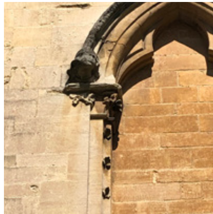
21. Example of engaged column to north elevation