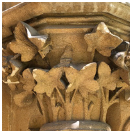
8. Missing flower to carved arch base