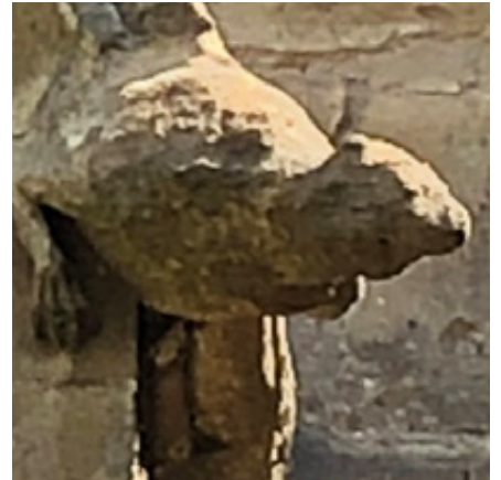
19. Carved head to Annexe buttress