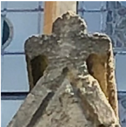
20. Pinnacle to Annexe buttress