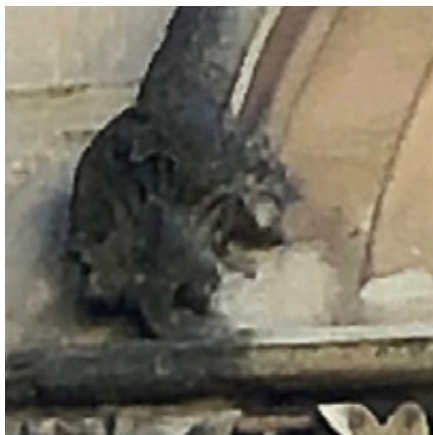
16. Missing leaf to carved stone head