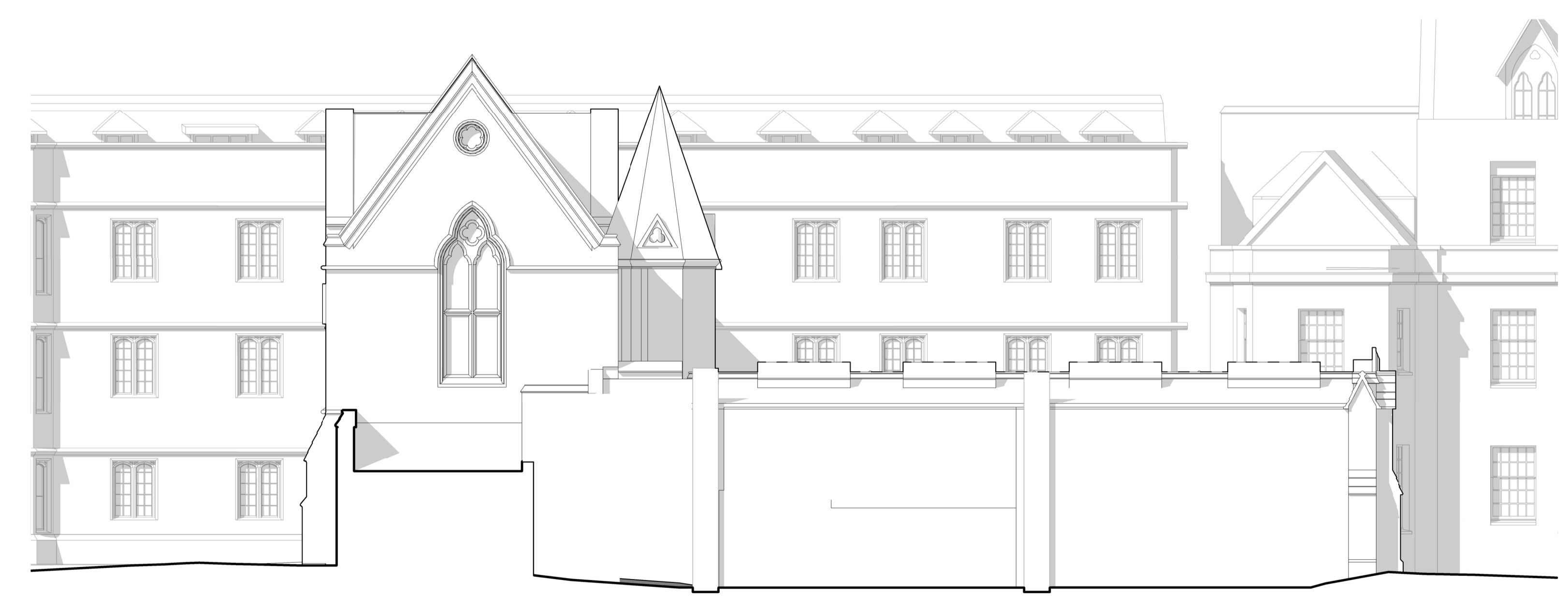
2 Existing Elevation - East 1 : 100