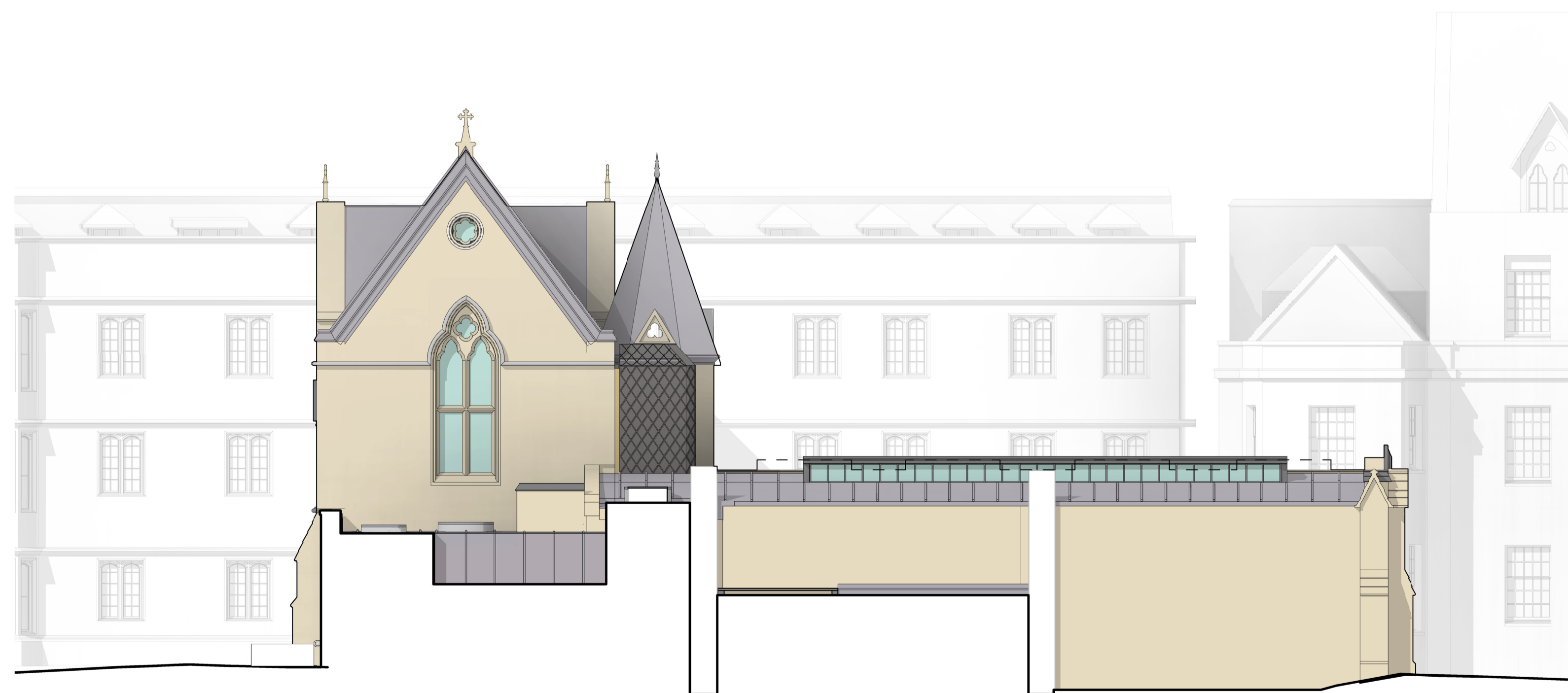
2 Proposed Elevation - East 1 : 100