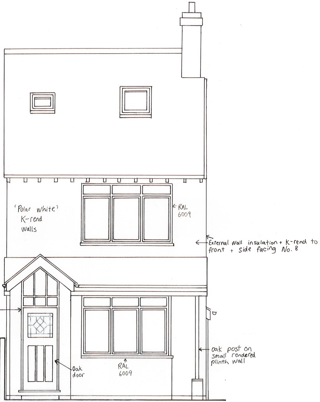
FRONT 'N.W.' ELEVATION AT 1:50