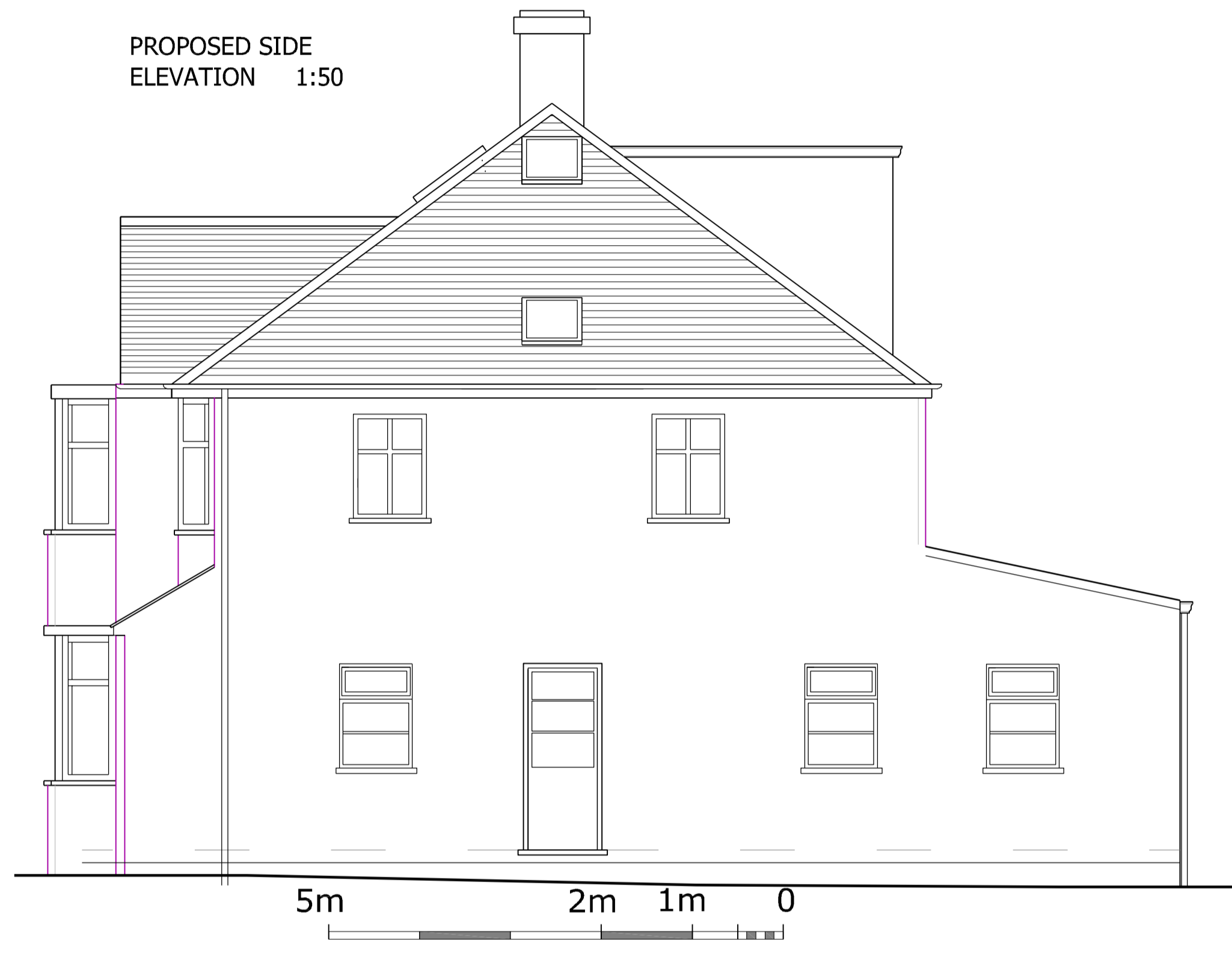
PROPOSED SIDE ELEVATION 1:50