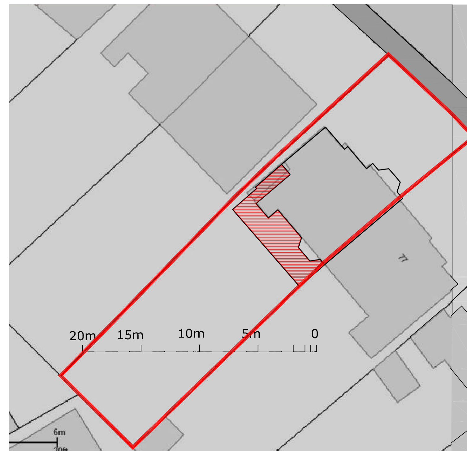
BLOCK PLAN 1 : 200