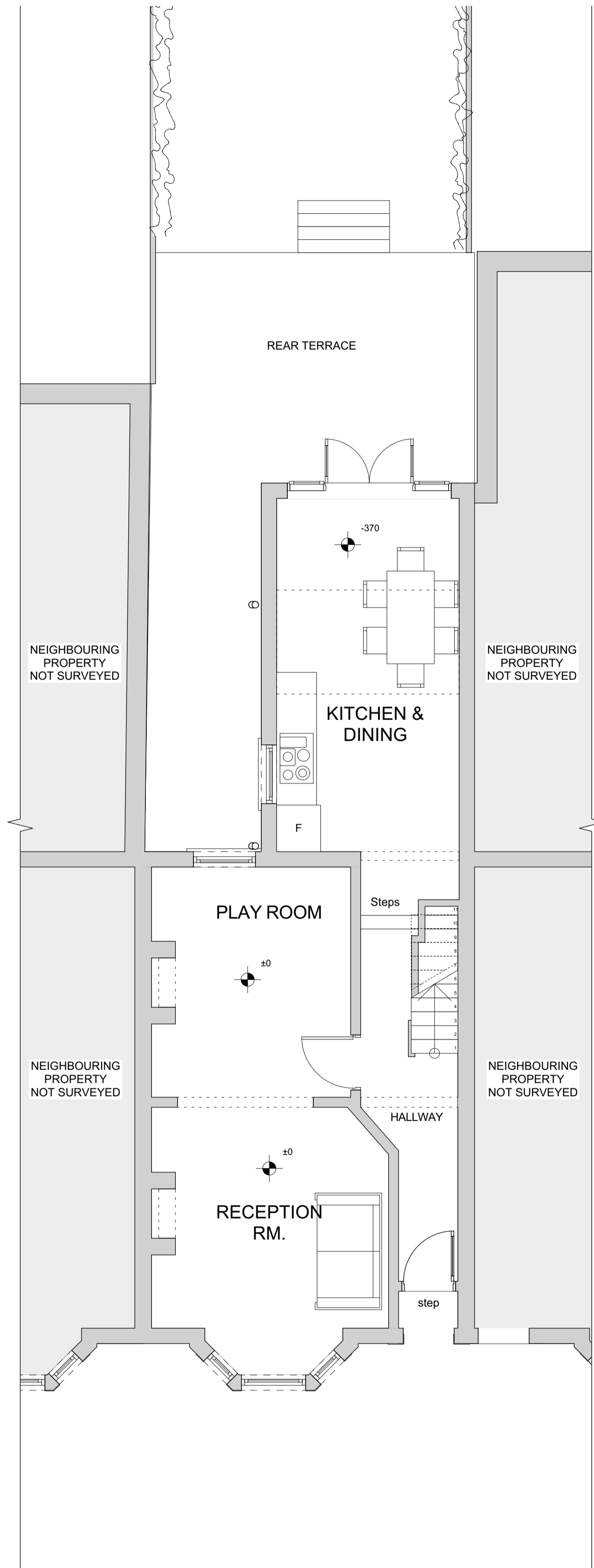
A EXISTING GROUND FLOOR PLAN