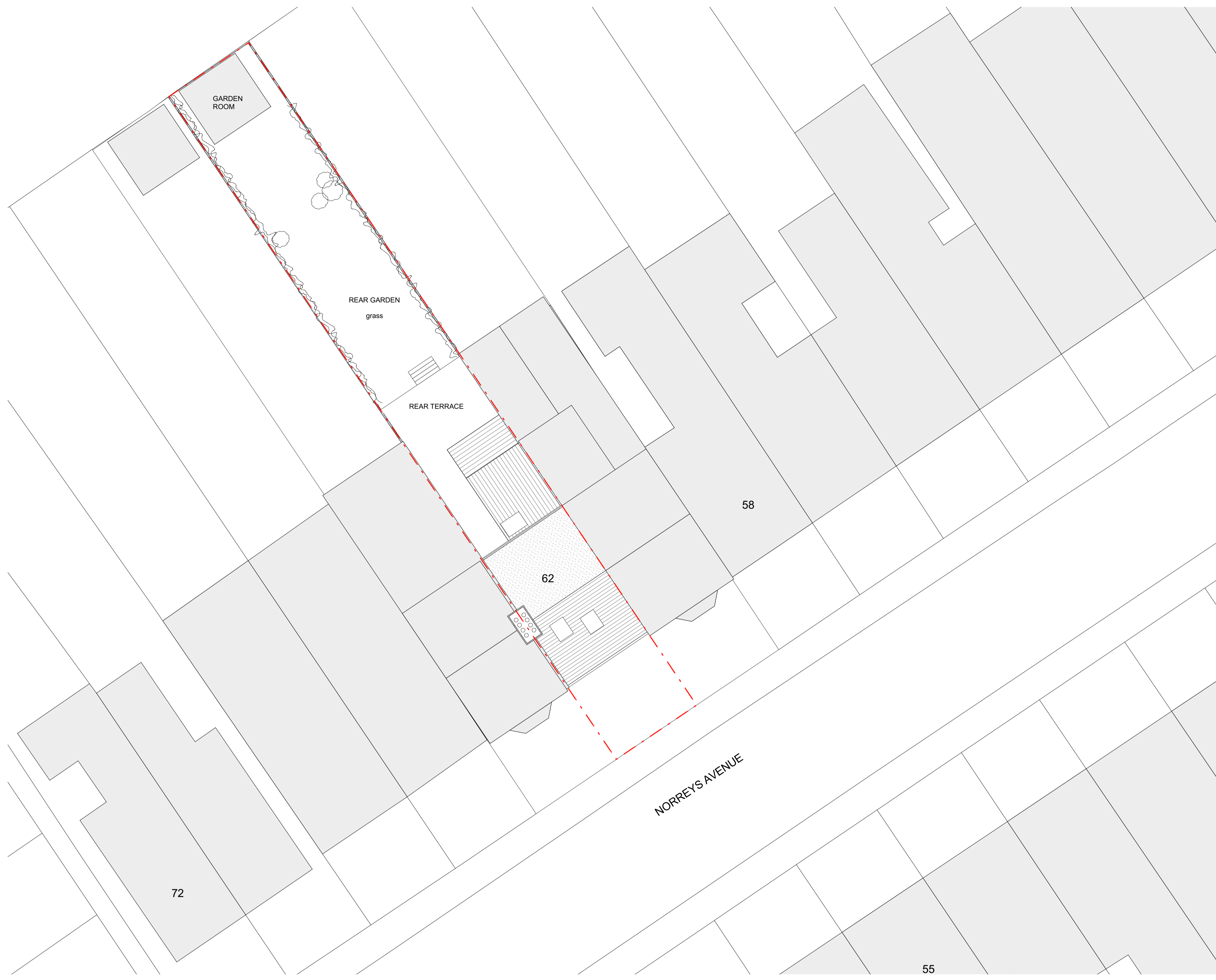
A EXISTING SITE / ROOF PLAN 102 Scale: 1:100 @ A1 / 1:200 @ A3