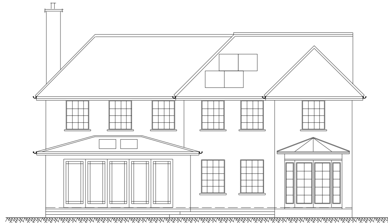
rear elevation (west)