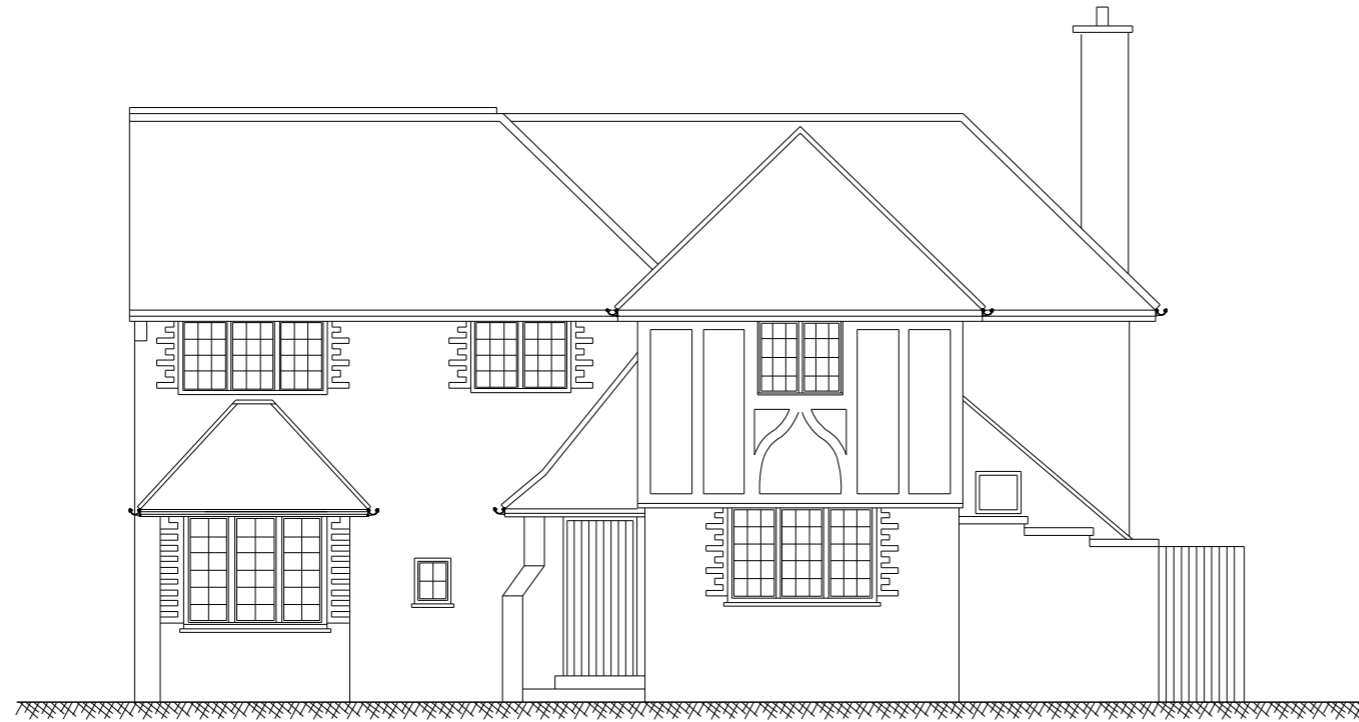
front elevation (east)