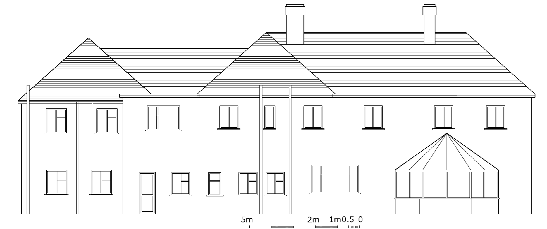
EXISTING REAR ELEVATION 1 : 100