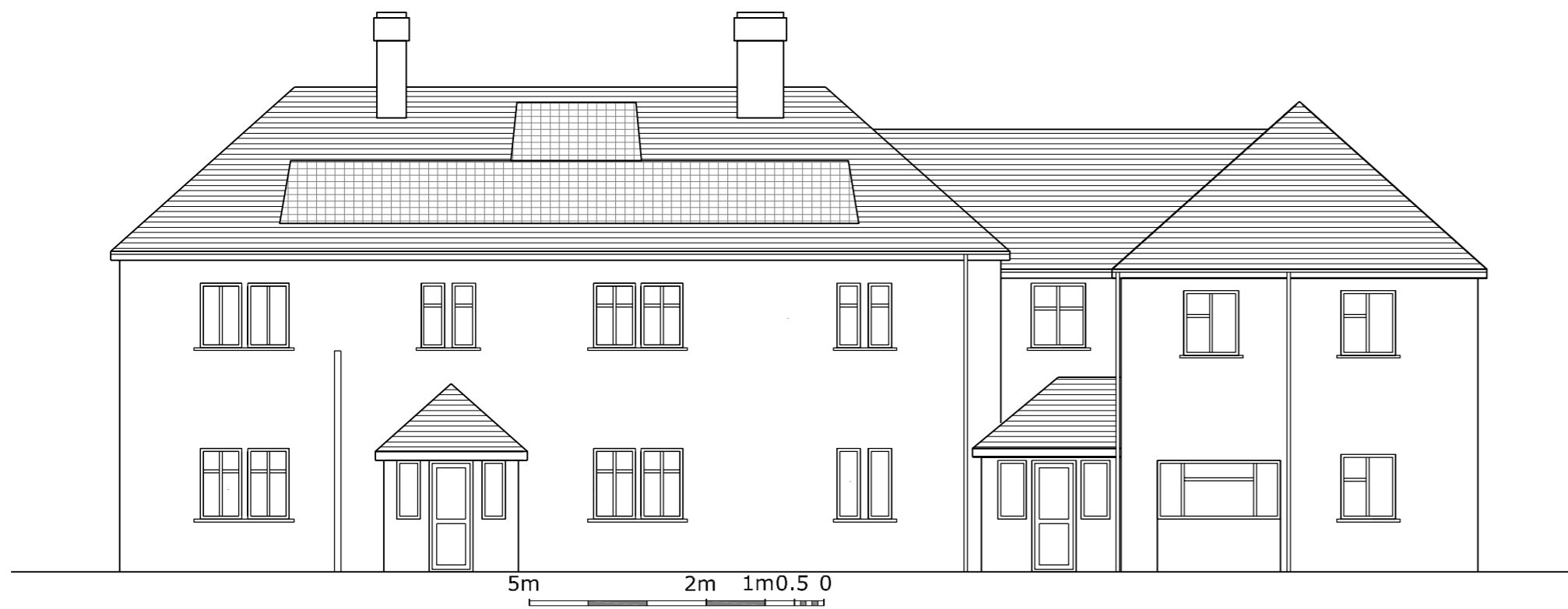
EXISTING FRONT ELEVATION 1 : 100