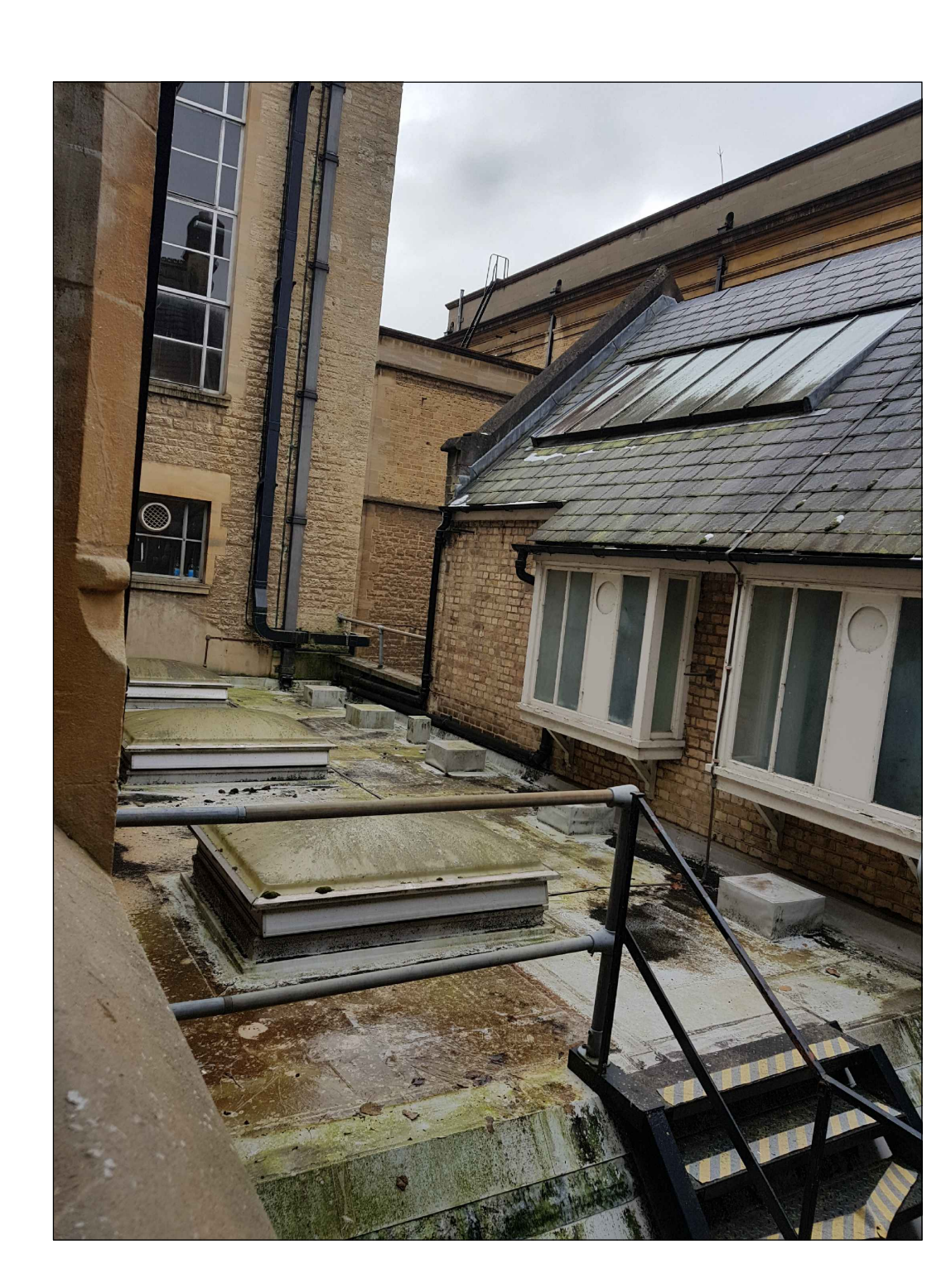
Site photograph of Purcell elevation 12 (viewport no \frac{2}{3008} below)