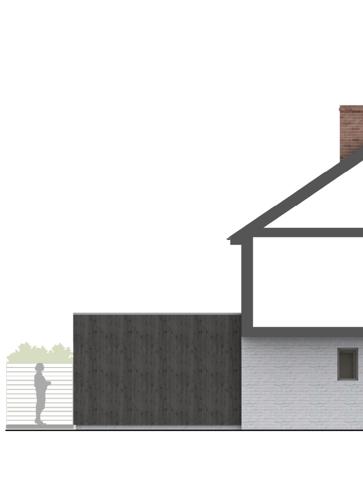
002 | proposed north / side elevation | 1:100 @ A3