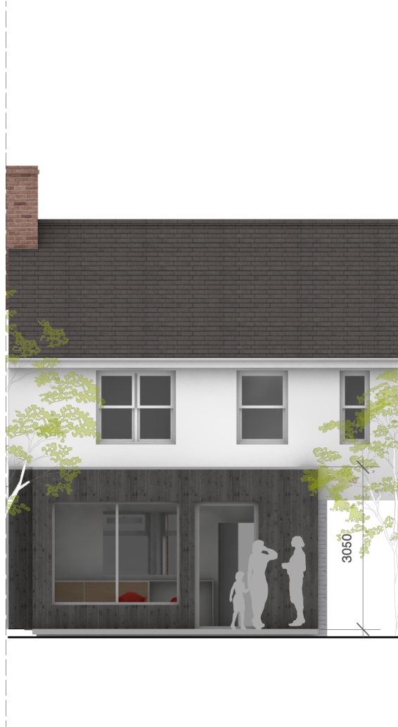
001 | proposed east / rear elevation | 1:100 @ A3