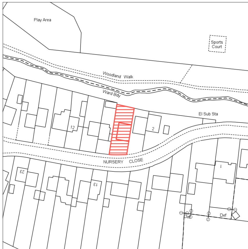
6, Nursery Close, Tonbridge