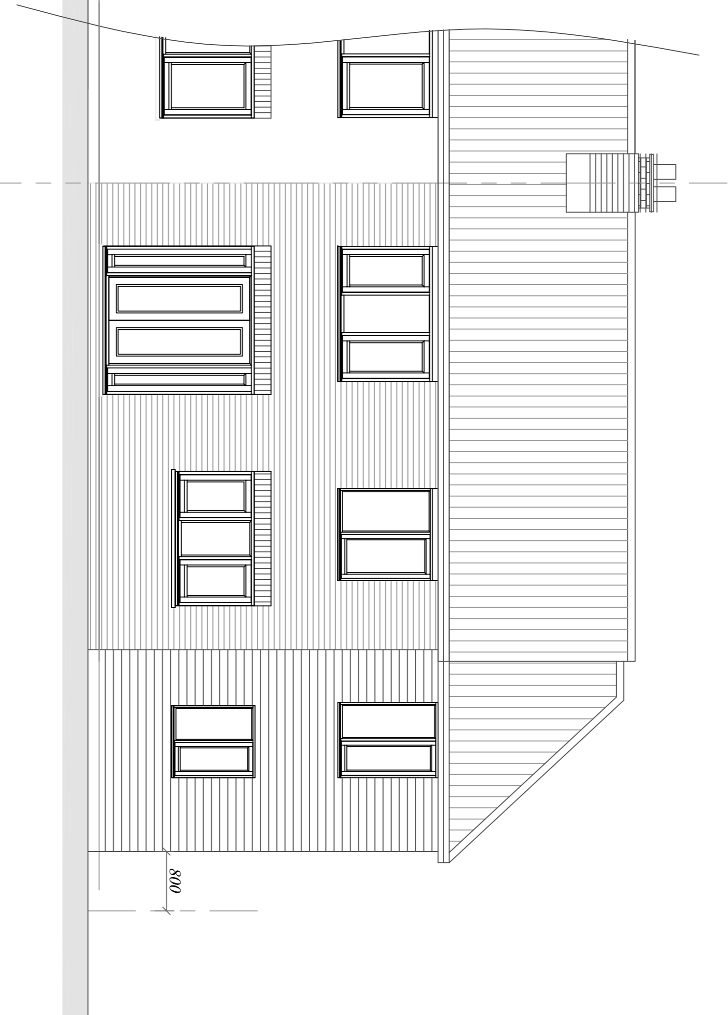
Rear Elevation Proposed