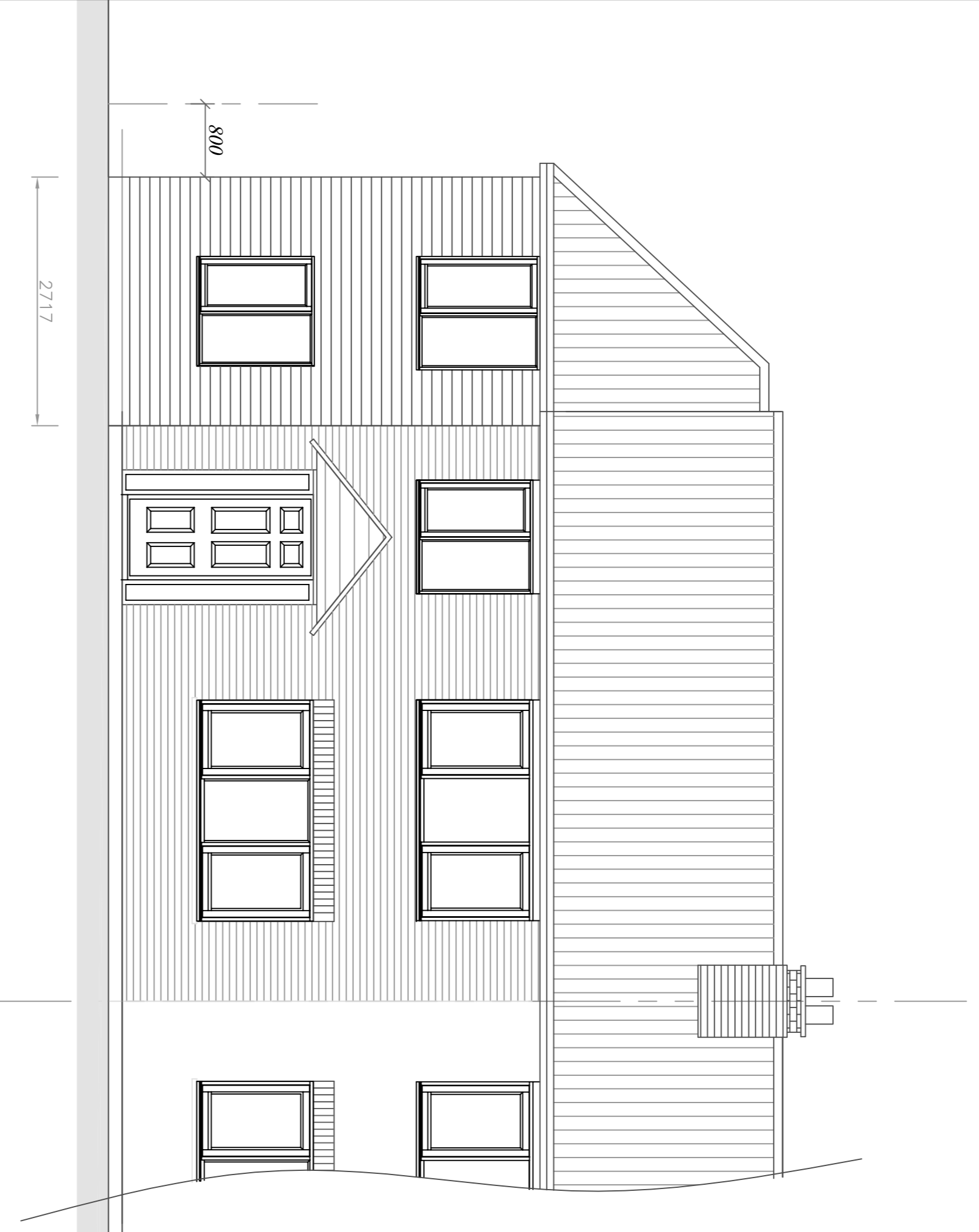
Front Elevation Proposed