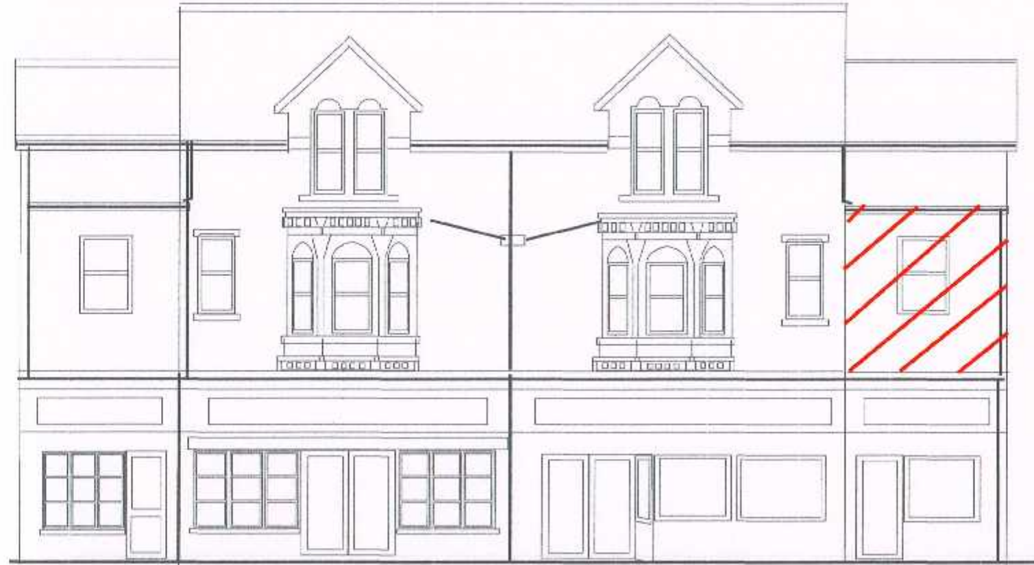
Proposed Front Elev Retrospective