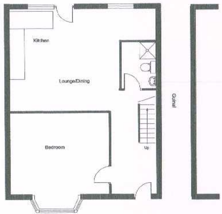
Existing Ground Floor