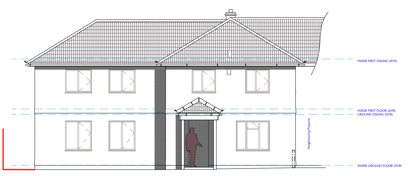
Proposed Front elevation (East)