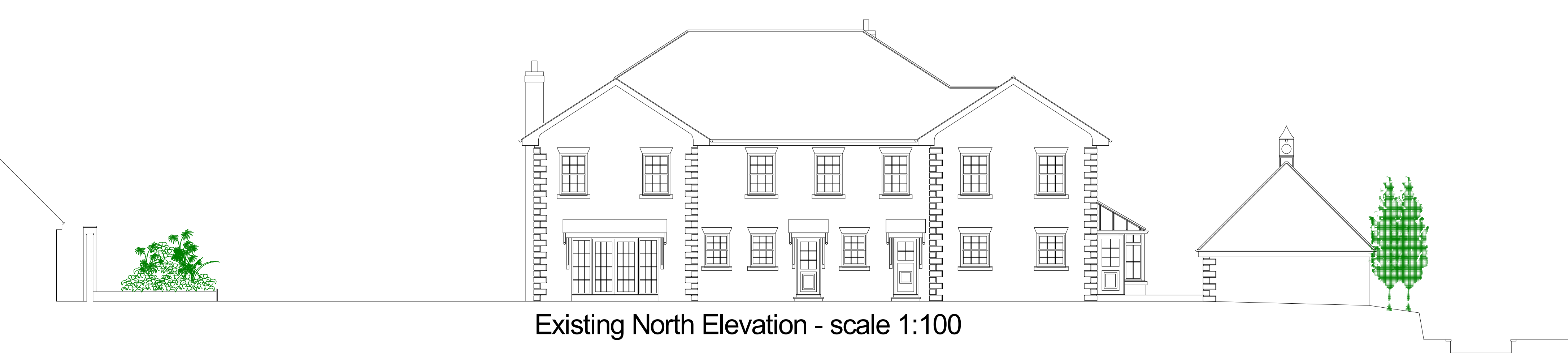
Existing North Elevation - scale 1:100