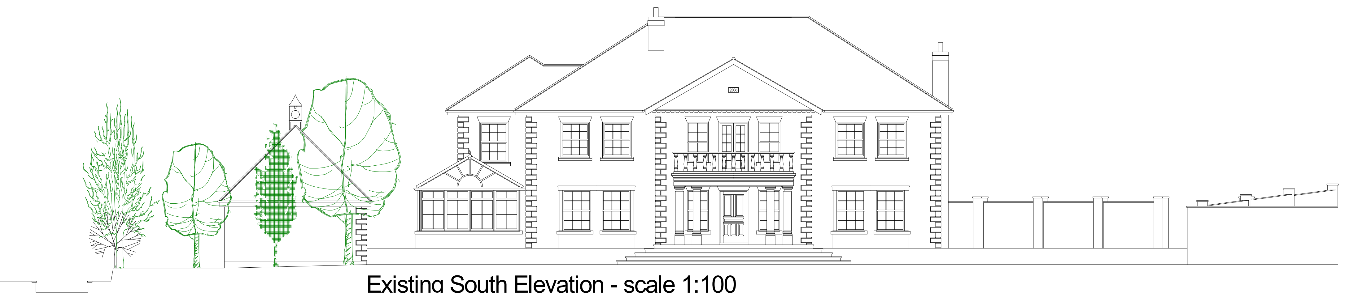
Existing South Elevation - scale 1:100