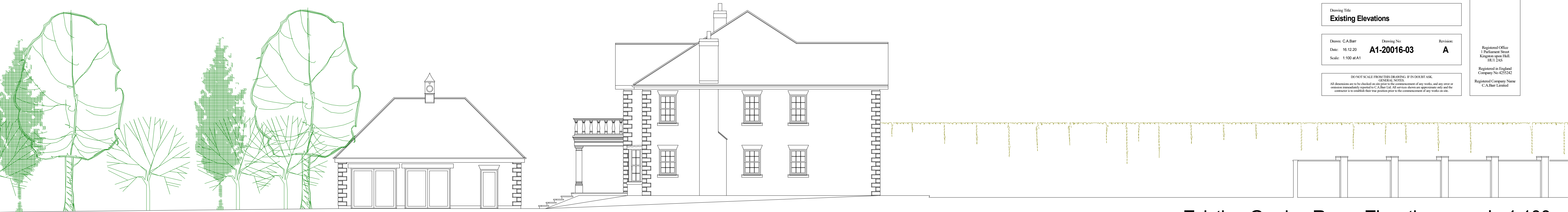
Existing East Elevation - scale 1:100