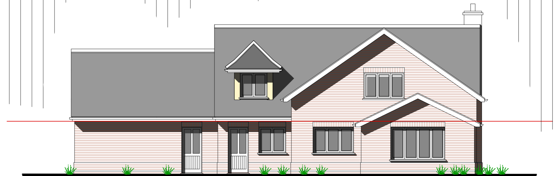
Rear Elevation 1:100 Scale

1:100 scale Bar This Drawing has been produced for printing onto A2 size paper, If printing on A3 please use the scale below for reference.