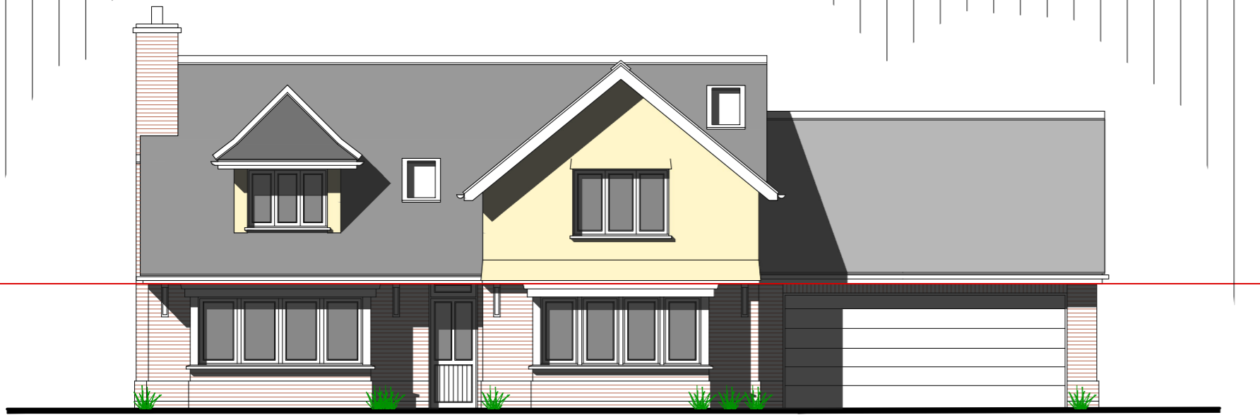
Front Elevation 1:100 Scale