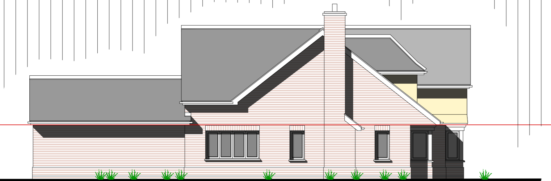
Side Elevation 1:100 Scale