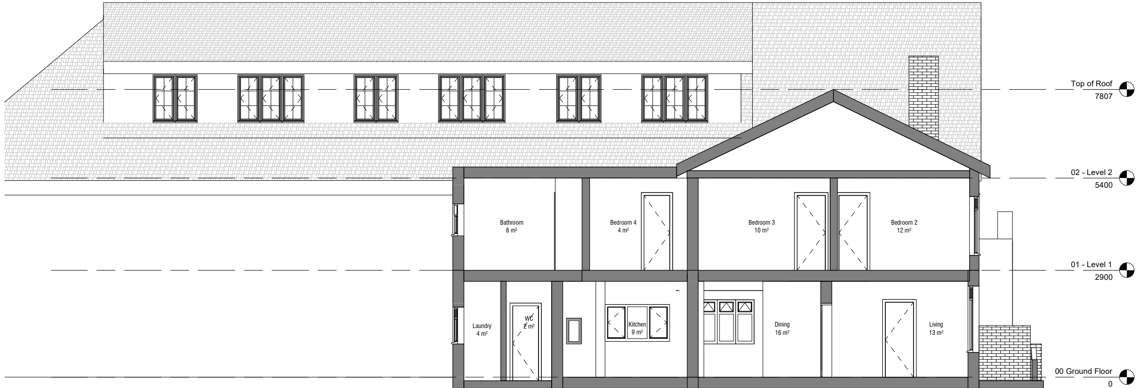
1 Section 1 E007 1:50