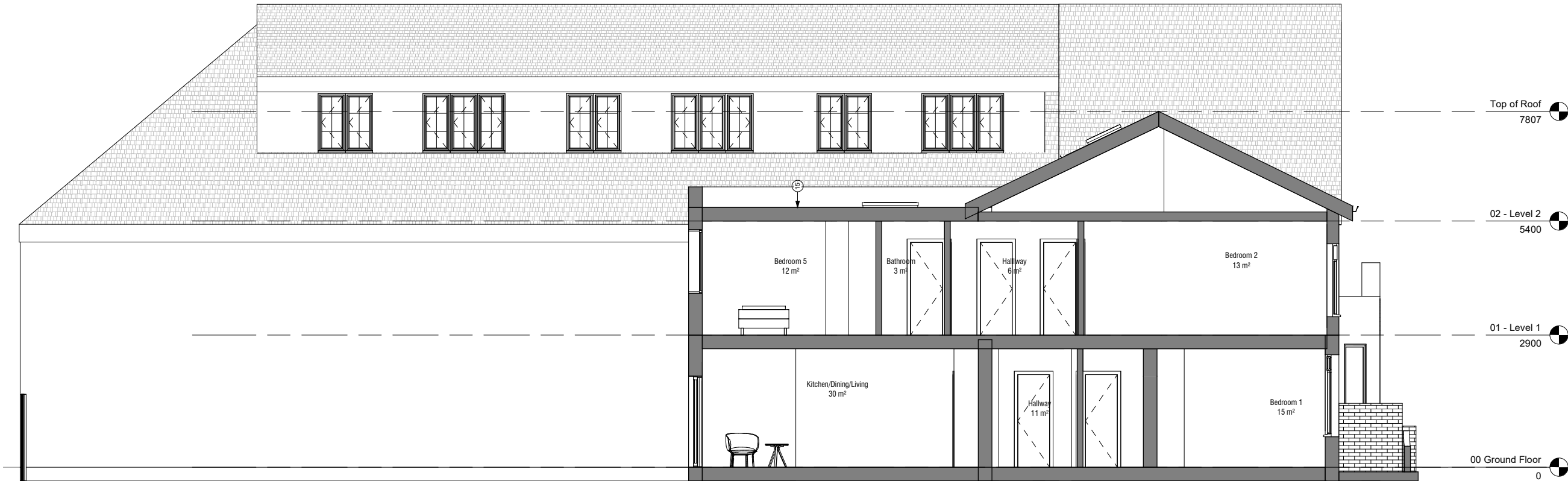
1 GA005 Section 3 1:50