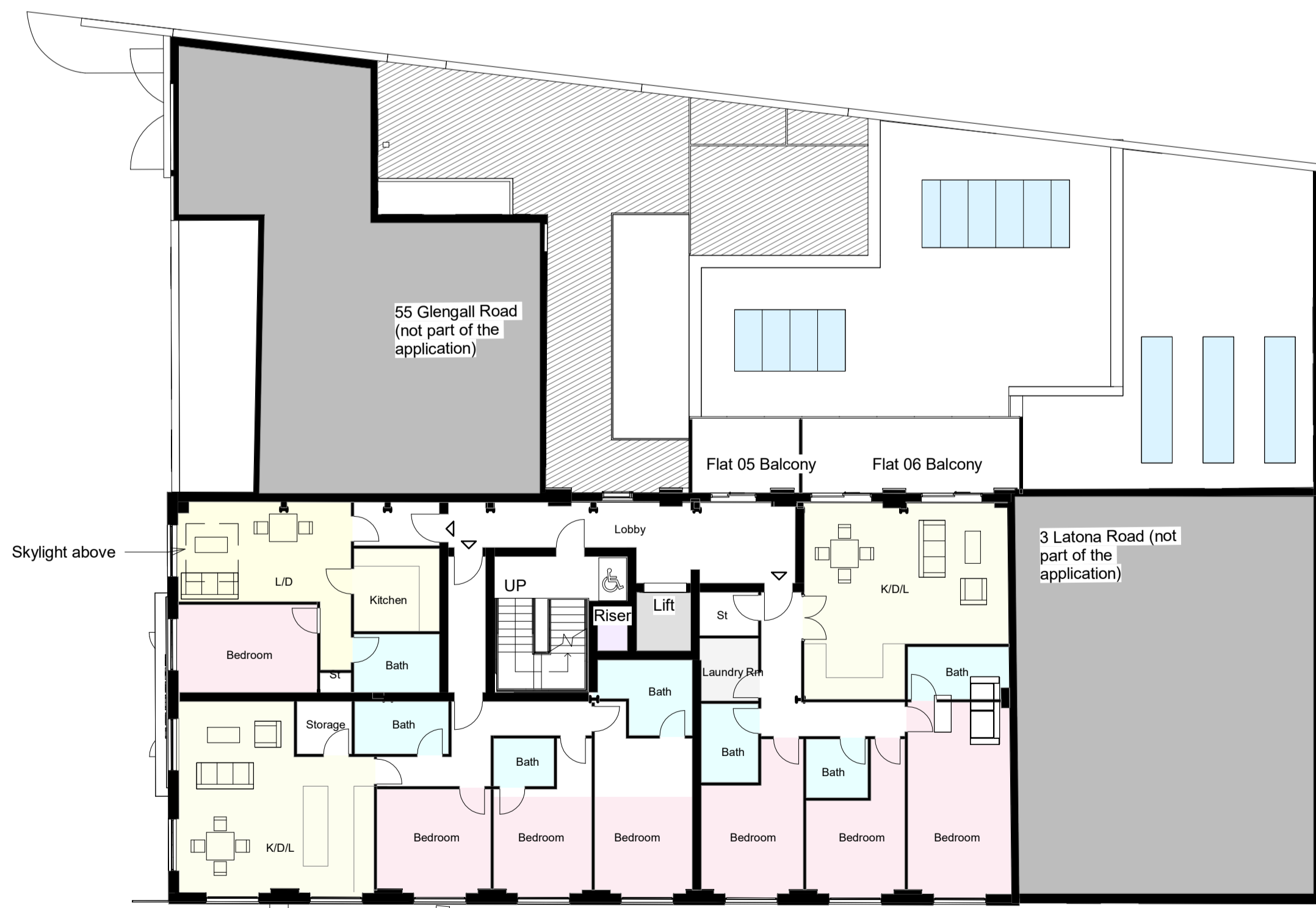
3 Second Floor - Key Plan 1 : 150