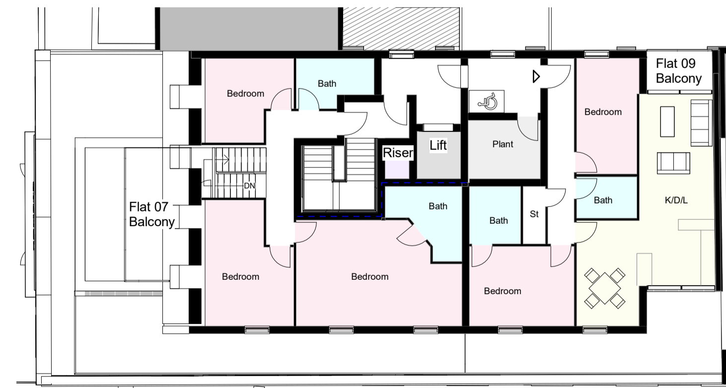
5 Fourth Floor - Key Plan 1 : 150