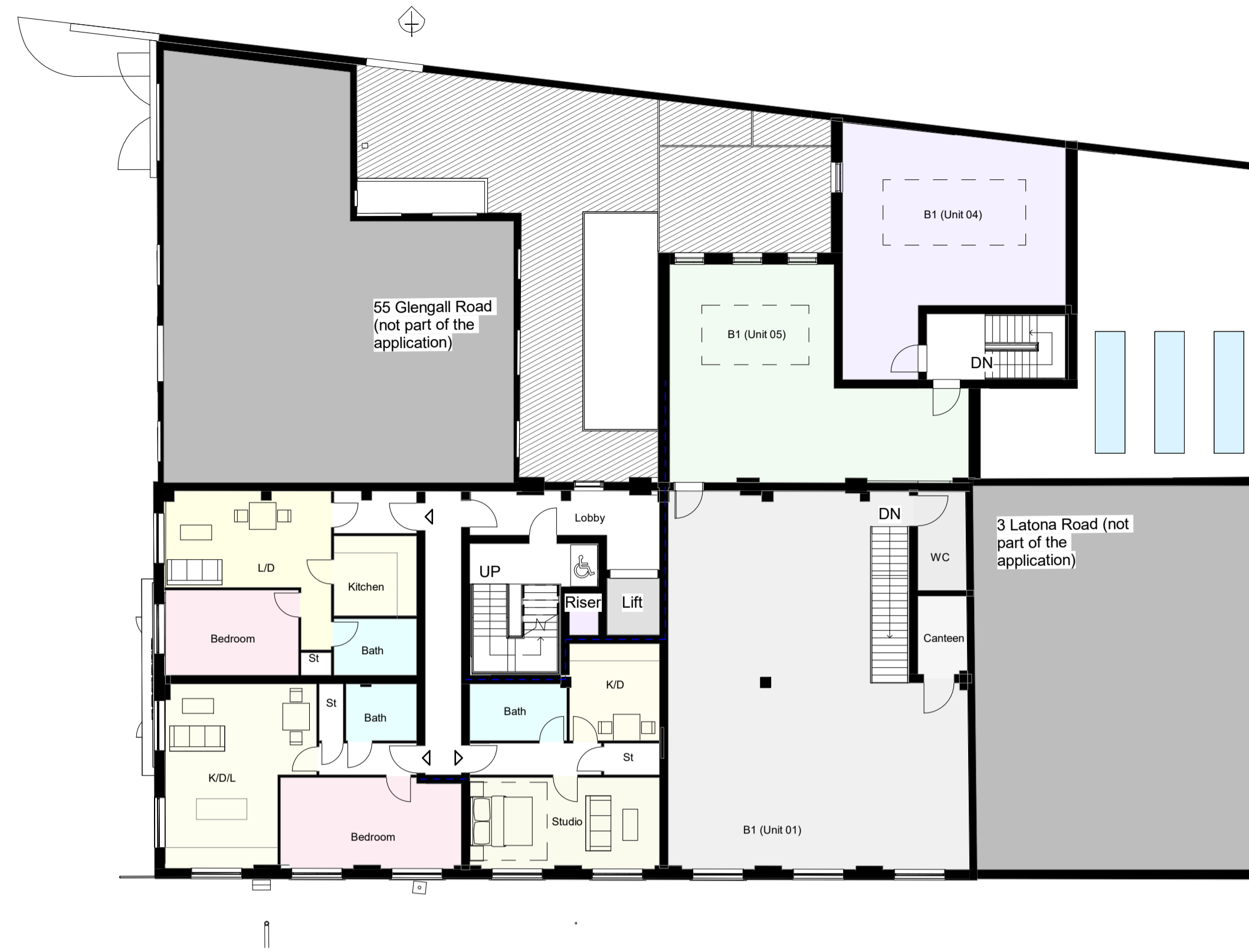
2 First Floor - Key Plan 1 : 150