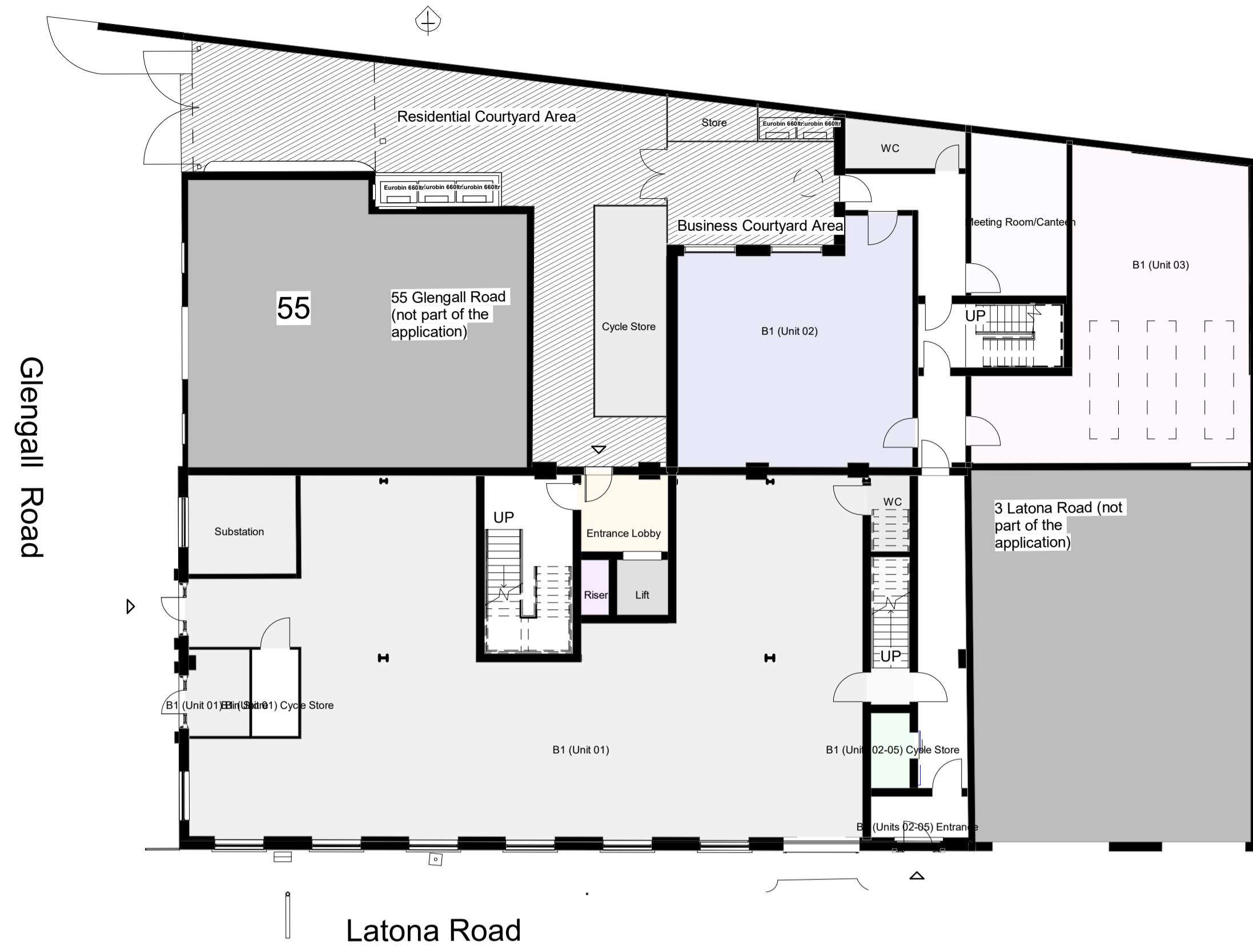
1 Ground Floor - Key Plan 1 : 150