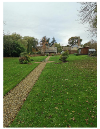
Existing garden (above)

The proposed building is modern in appearance, using materials typical of it's garden setting. The design is not contrived and does not attempt to replicate any original features of any nearby buildings within the conservation area. It will present an obvious addition which will blend subtly into the garden space over time.