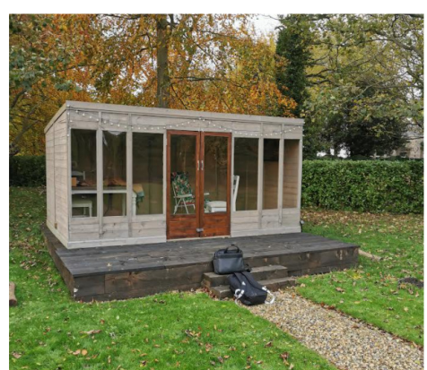
Existing summer house to be removed & replaced