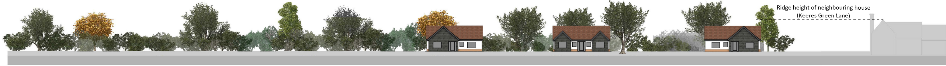
Proposed Site Elevation B-B 1:500