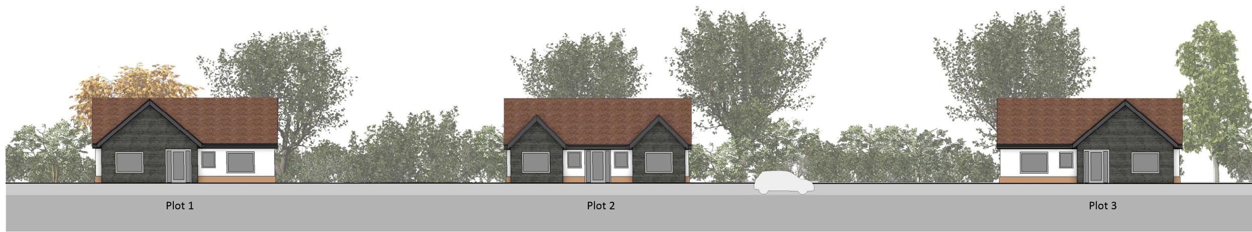
Proposed Site Elevation C-C NTS