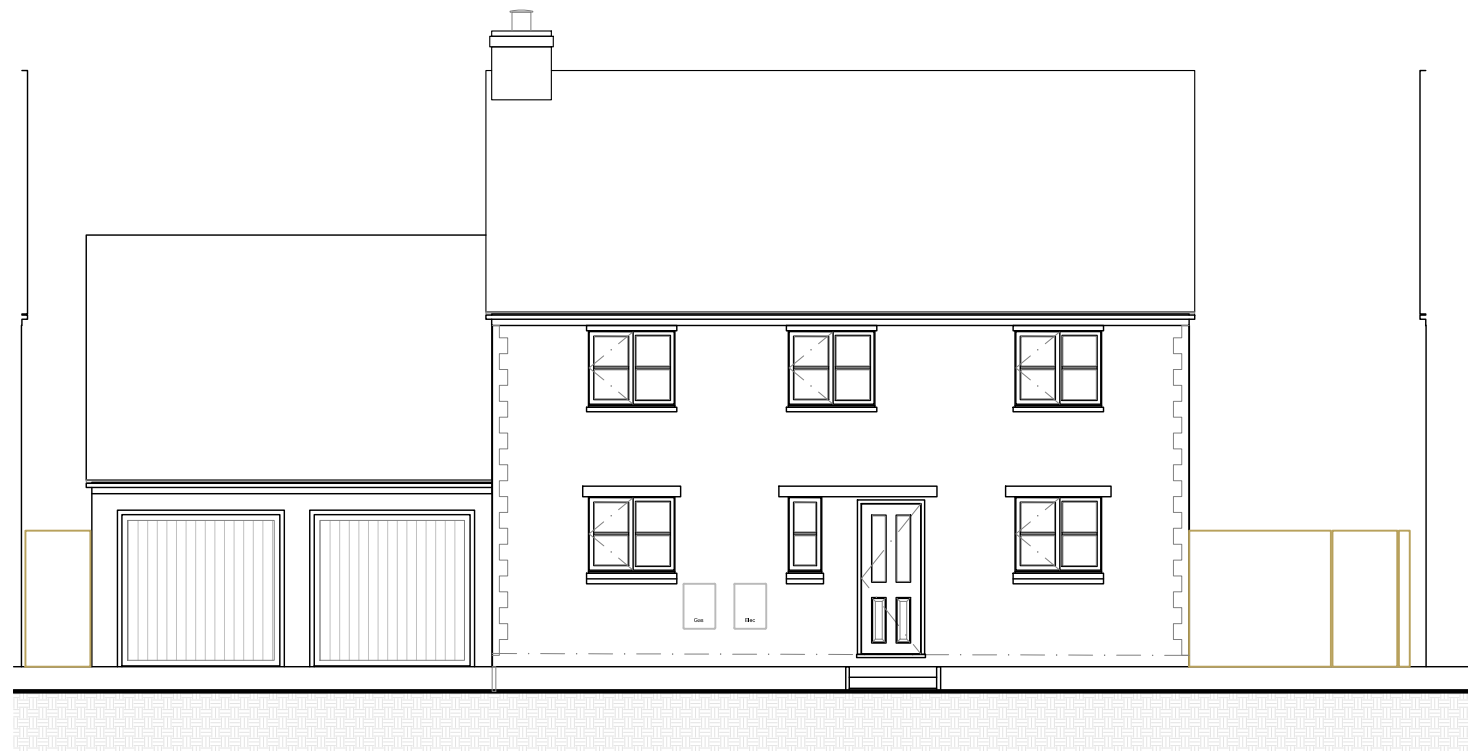
01 - Proposed Front Elevation (North West as Existing) Scale 1:100

ALL DETAILS ARE INDICATIVE. CONTRACTOR TO PROVIDE FULL CONSTRUCTION DETAILS PRIOR TO COMMENCEMENT OF WORKS