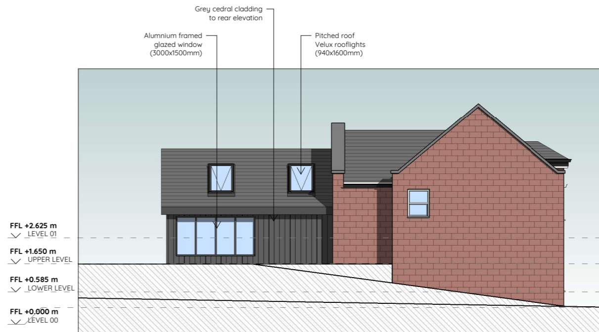
2 NORTH ELEVATION - AS PROPOSED 1:100