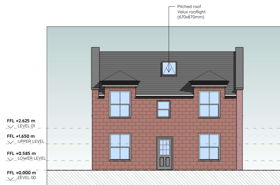
4 WEST ELEVATION - AS PROPOSED 1:100