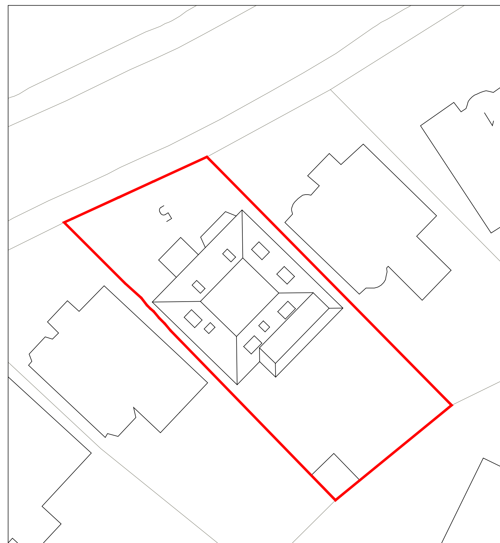
PROPOSED BLOCK PLAN SCALE 1:200@A1