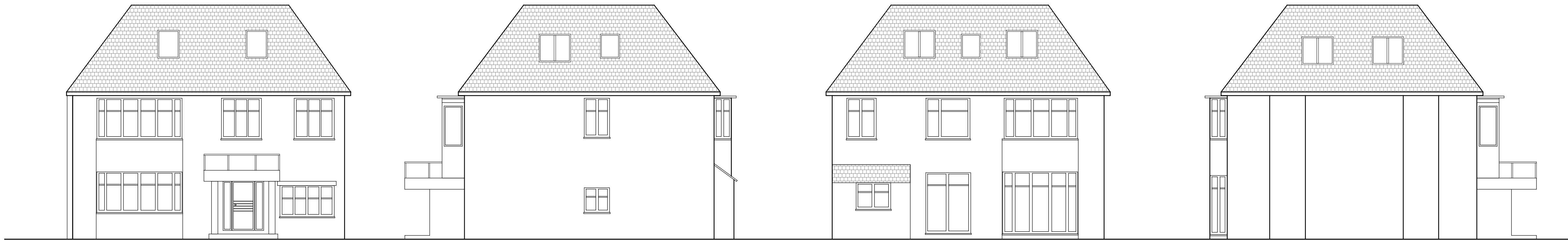
FRONT ELEVATION AS EXISTING SCALE 1:100@A1