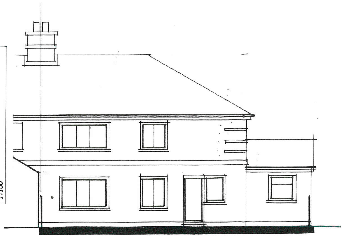
EXISTING REAR ELEVATION 1:100

PROPOSED REAR SINGLE STOREY EXTENSION 4 SOUTH END PITTINGTON COUNTY DURHAM