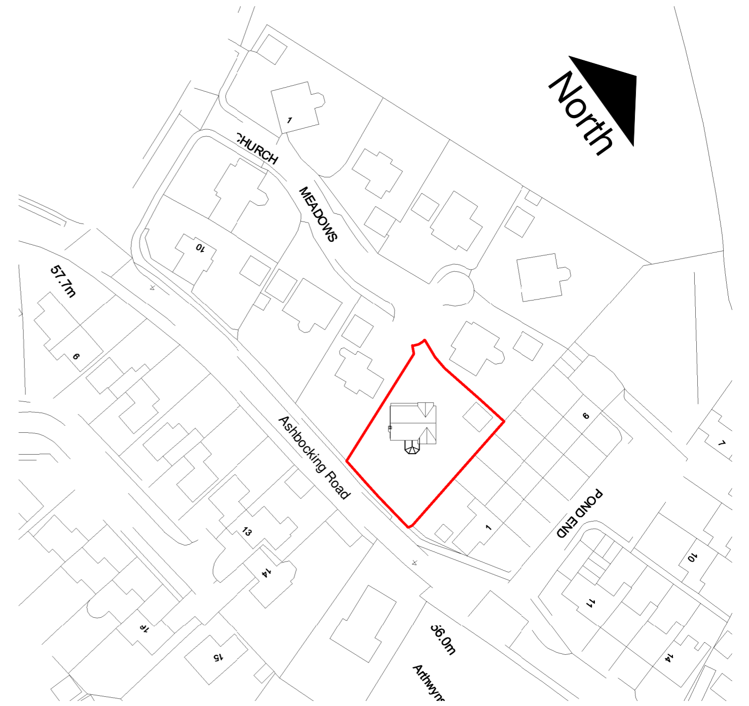
Site Location Plan 1 : 1000