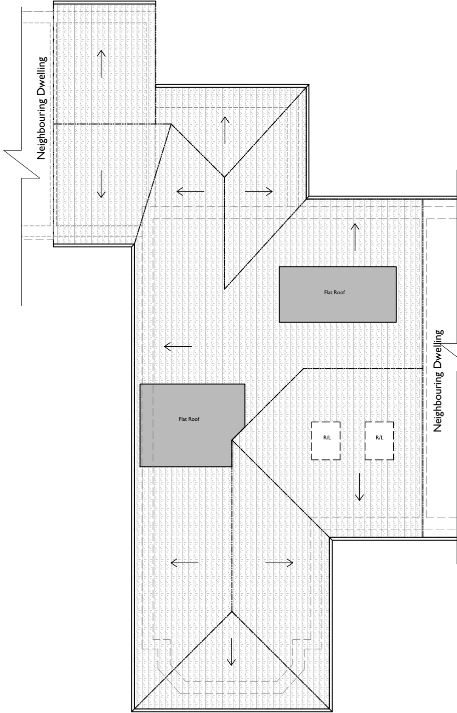
Existing Roof Plan