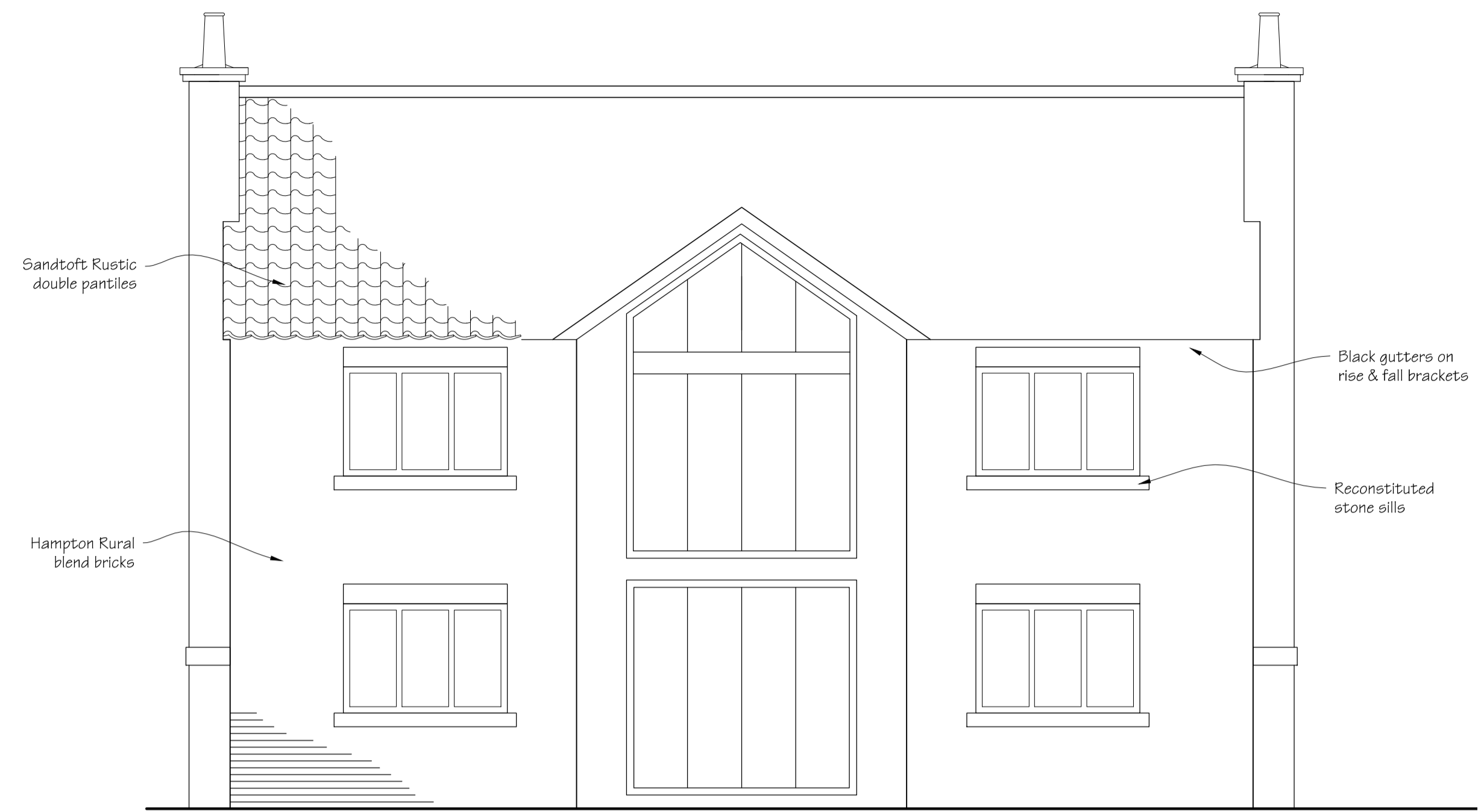
PROPOSED FRONT (South) ELEVATION Scale 1:50