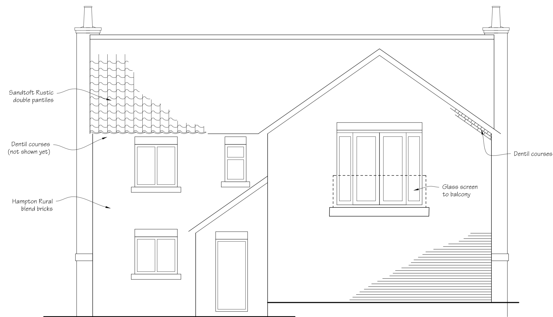
PROPOSED REAR (North) ELEVATION