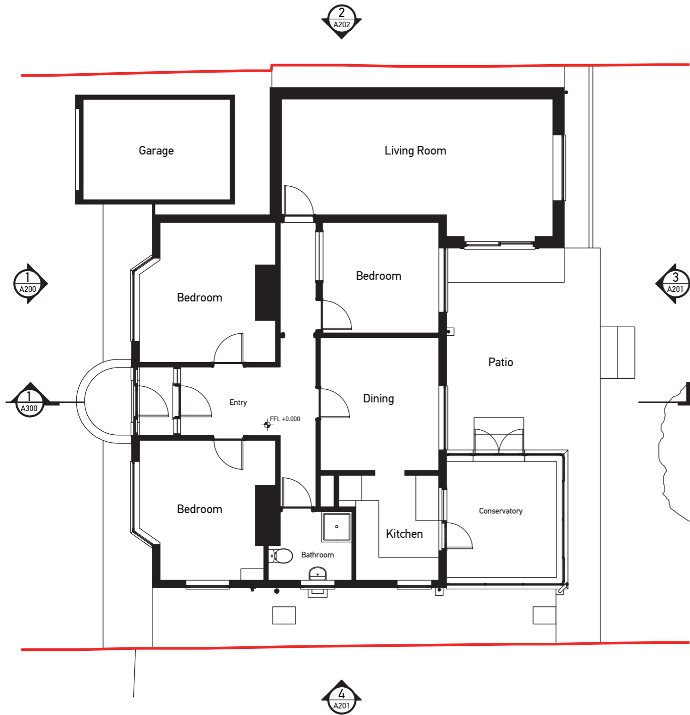
1 Existing Ground Floor Plan 1:100