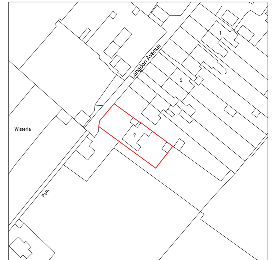
1 Existing Site Plan 1:200