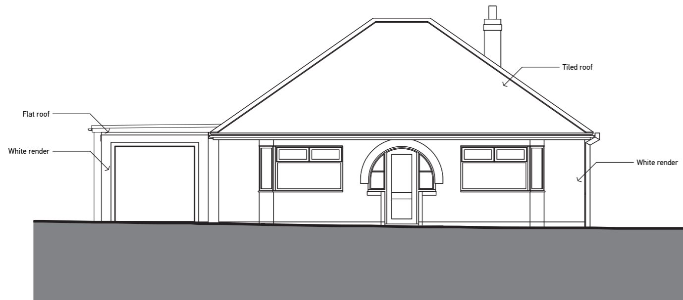
1 Existing North West Elevation 1:100