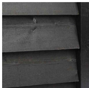
Horizontal boarding Black finish