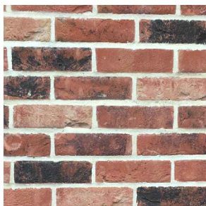
Red multi brickwork Forterra - Hampton Rural Blend