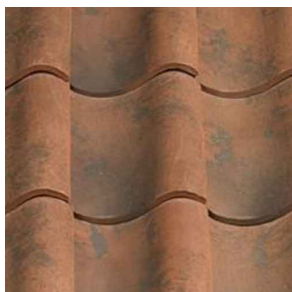
Red clay pantiles Sandsoft - New Arcadia (reclaimed finish)