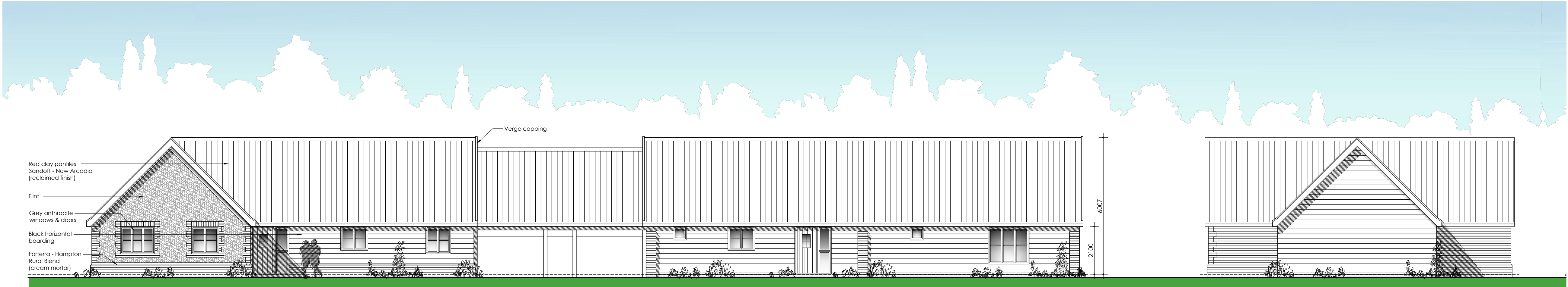
Plot 2 Front Elevation - east