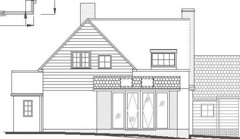
Proposed House Side Elevation Scale 1:100