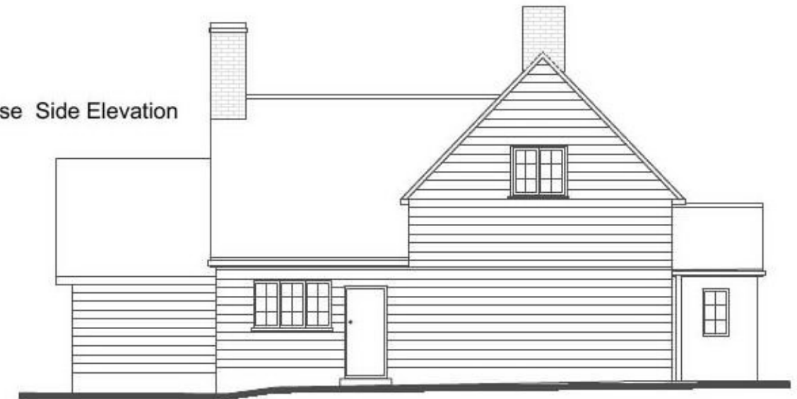
Proposed House Side Elevation Scale 1:100