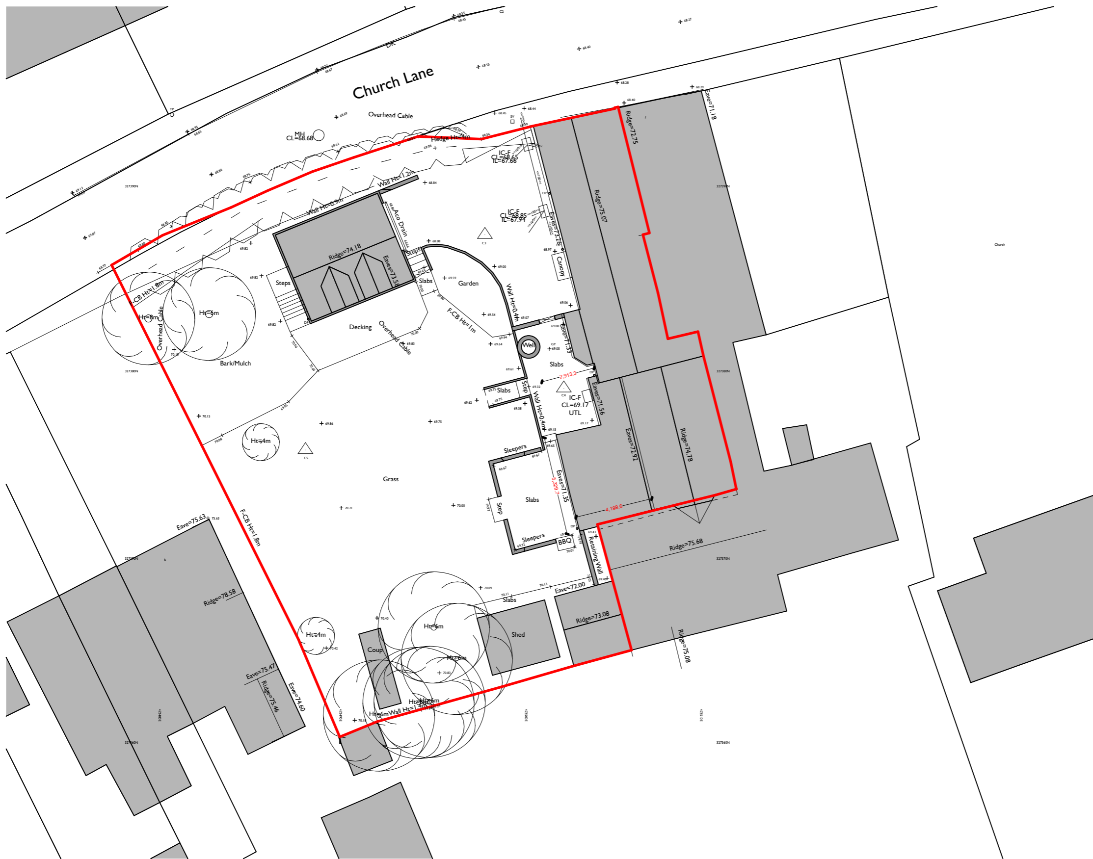
Site Location Plan Scale 1:200