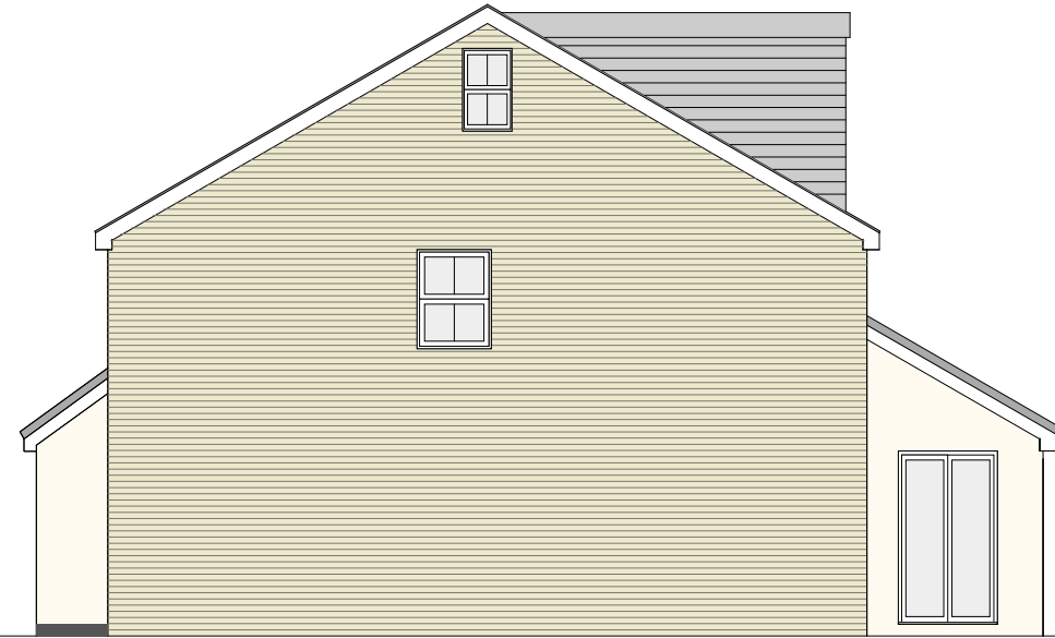
Proposed Side Elevation 1