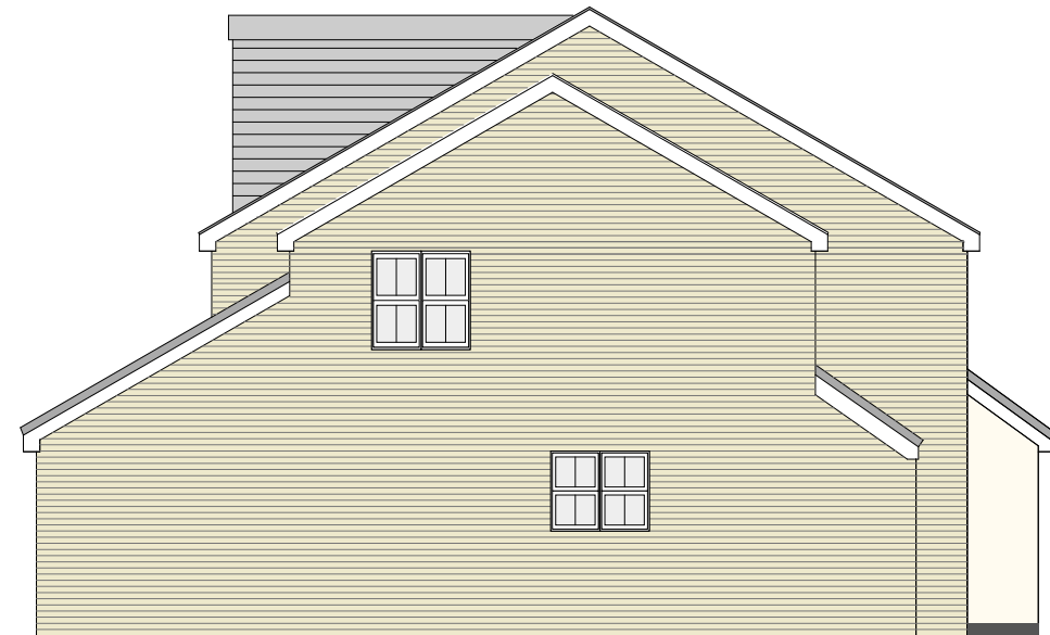
Proposed Side Elevation 2