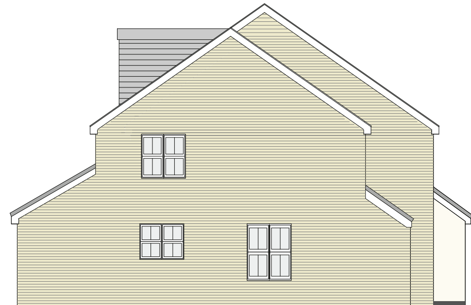
Proposed Side Elevation 2