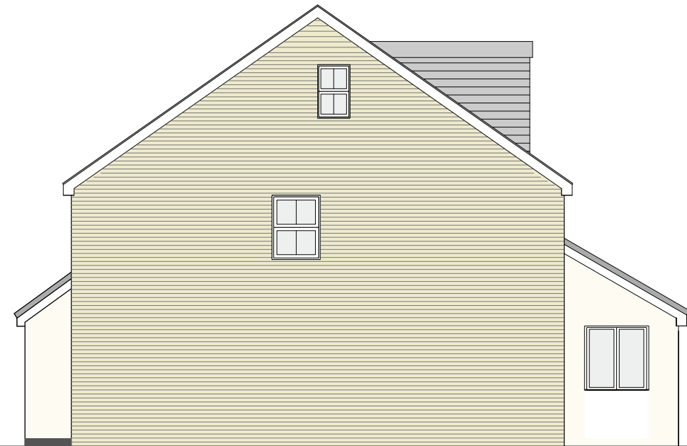
Proposed Side Elevation 1