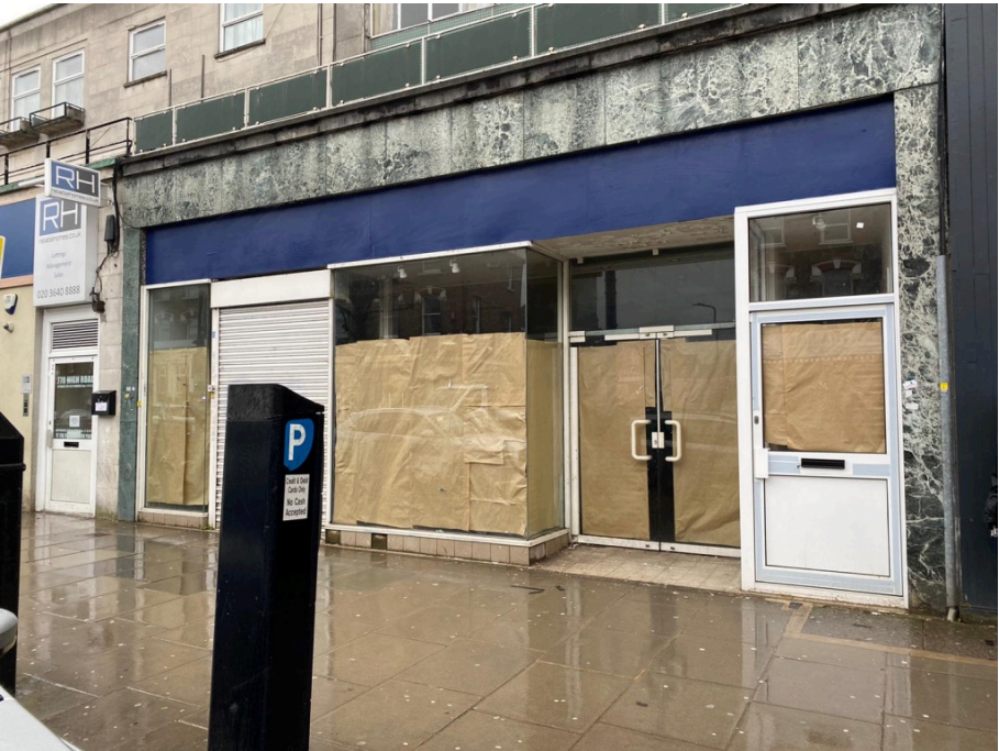
SHOPFRONT AS EXISTING