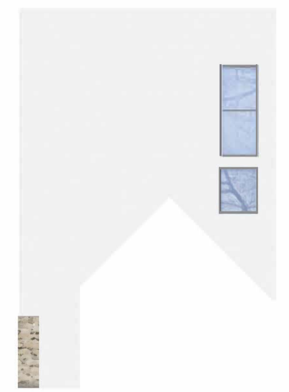
4 EAST (HOUSE 3 ABOVE ADJACENT ROOF LINE)