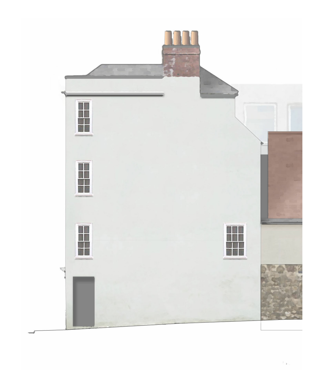
North - Existing