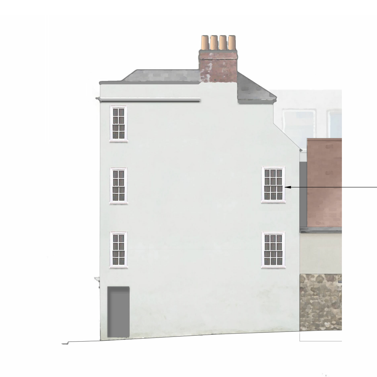
North - Proposed