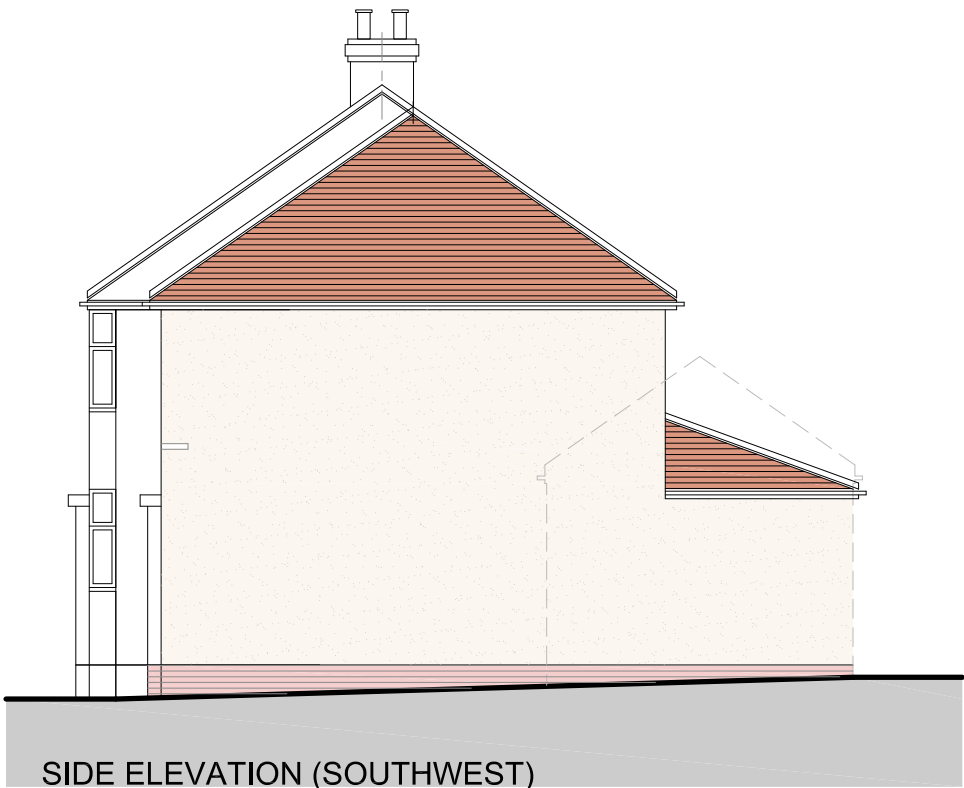
SIDE ELEVATION (SOUTHWEST)