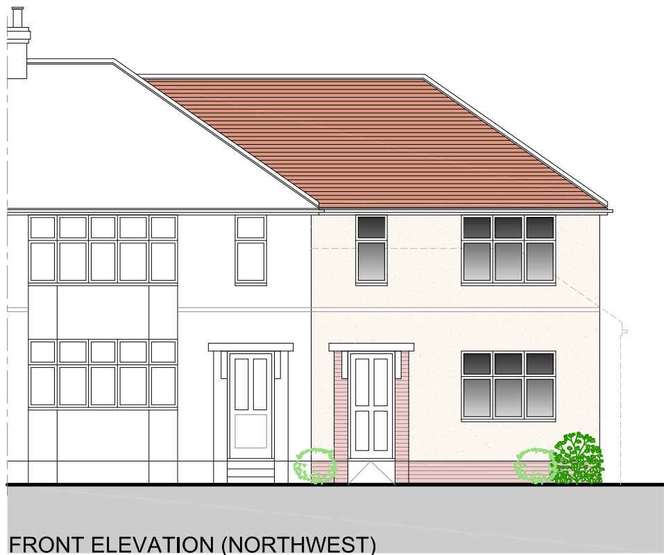
FRONT ELEVATION (NORTHWEST)