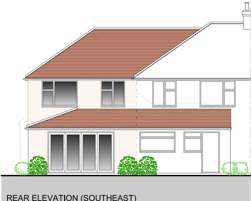
REAR ELEVATION (SOUTHEAST)