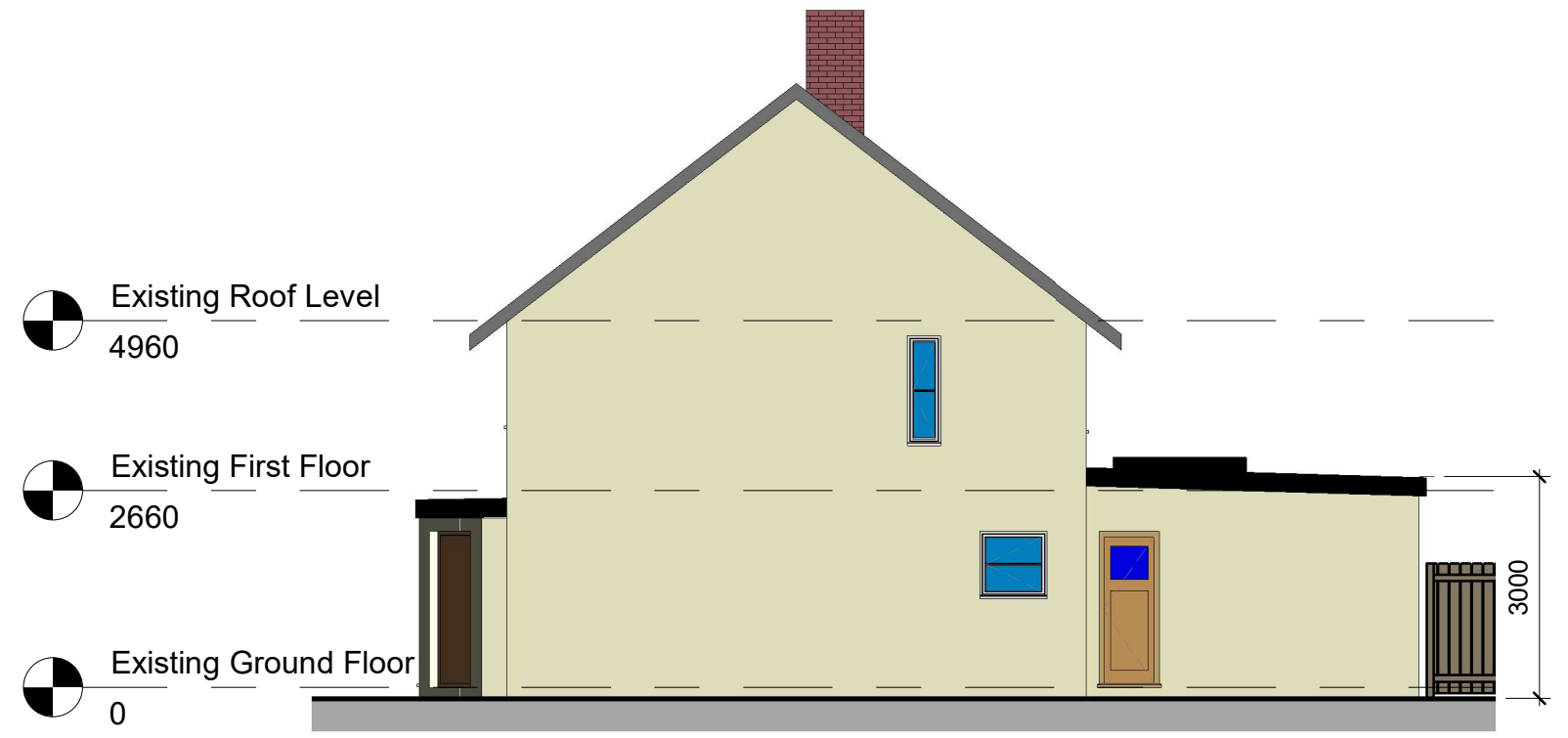
3 Proposed East Elevation 1 : 100