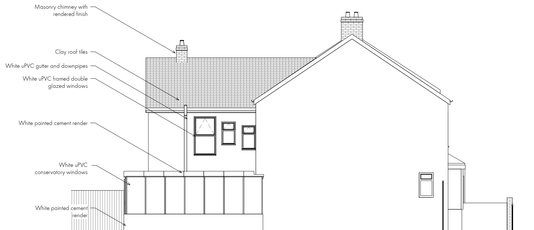
3 Side Elevation 1 : 100