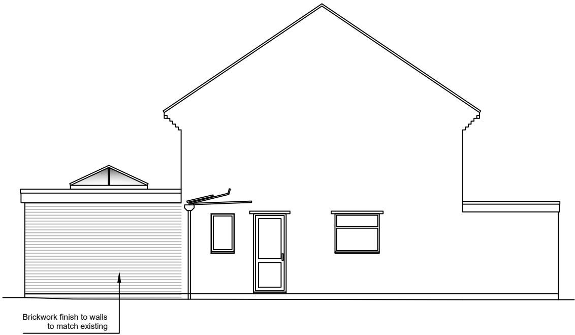
Left Side Elevation